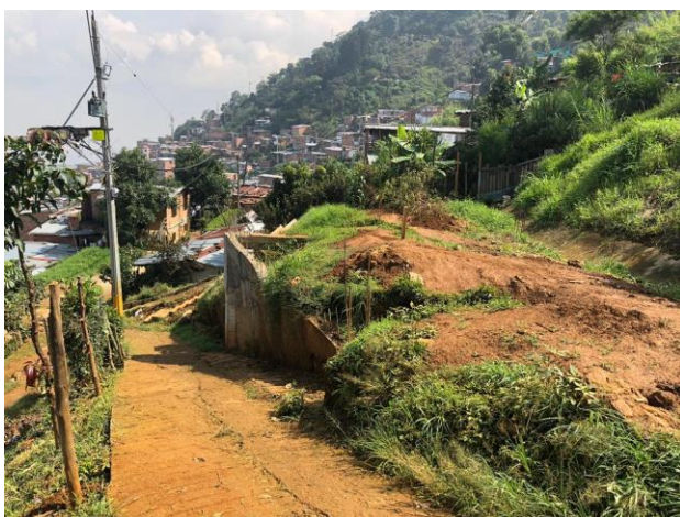
Figure 2. Photograph of the east side of the Aburrá valley. It shows the vertical profile of one slope from another slope.

The start of the history of risk management in Colombia dates back to 1989 with the establishment of the National System for the prevention and attention of disasters at the national level. At the municipal level the Agreement 14 of 1994 founded the Municipal System for the Prevention and Attention of disasters. These systems that were mainly dedicated to the attention and prevention of disasters and emergencies evolved to locally adapted risk management systems that aim at sustainable development and to adapt to climate change. The basis of the current Risk management systems is the Law 1523 of 2012 that creates the National Unit for Disasters Risk Management at the national level. It's counterpart at the municipal level is the Administrative Department of Disaster Risk Management – DAGRD. The latter is responsible for the development and implementation of municipal risk management plans, a municipal response strategy and recovery plans. In the case of Medellín these are articulated in the City's Land Use and Development Plans as well as in the Aburra river and Local Emergency and Risk management plans. One of the results of the risk management strategy of the city is a Multi-Hazard Map where it can be seen that a considerable part of the slopes of the mountains around the bottom part of the Aburrá valley have significant risk of landslides (Alcaldía de Medellín, 2015).