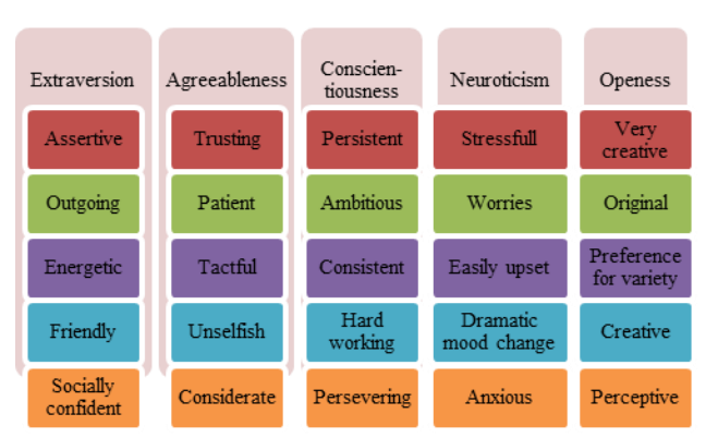
Figure 2 Personality traits in Big Five Model

2.4 Big Five Factor Model: Lastly, the most established tool in psychology field is Big Five Factor Model. In this model, there are five basic broad cores of personality trait (Figure 2) as believed by many contemporary personality psychologists as result of forty years of research. The five cores described are extraversion, agreeableness, openness, conscientiousness, and neuroticism.