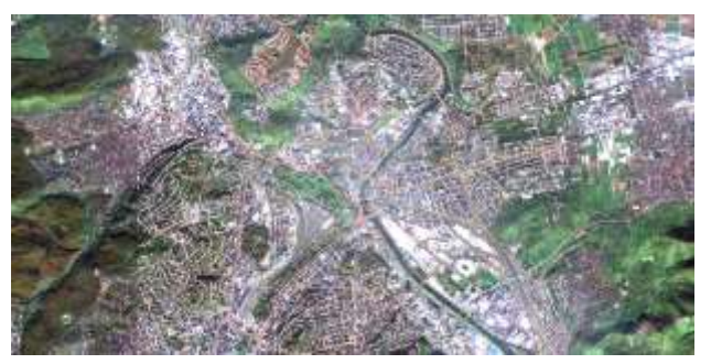
Figure 2. Exported image file of a disasterGIS project

Updating the project data is done by Osmosis . With the period of time from the configuration file Osmosis compares the timestamp of the local state file with the timestamp of the state file on the OSM servers. If the time difference is greater than the defined time period Osmosis requests all OSM data changes in osmChange format up to the last point of update. To transfer the data changes into the database osm2pgsql is used again, however in append mode. Thereby the new data are appended to the existing data instead of overwriting it. By using a bounding box only the relevant information for the disaster area will be stored in the database.