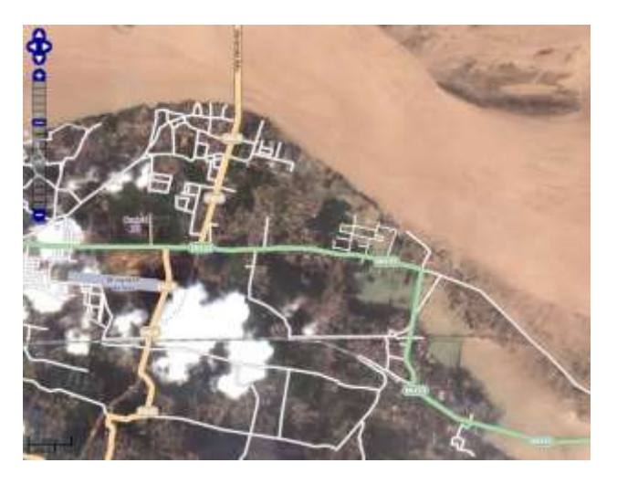
Figure 3. Tile-based visualization of flooded areas (flood event in India, 2016, data © OpenStreetMap-Contributors, USGS)

In comparison to the raster image the tiles have to be provided via webserver. Figure 3 shows a mapping client accessing the disasterGIS server.