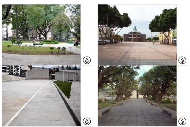
Fig. 1 Example of empathy cards.

The purpose of the interview is to know the perception of a user for a specific urban area. Questions made are organized in five areas of study, and we ask the users to answer the questions by choosing one out of four different predefined images (called empathy cards) and to briefly explain their selection. Every interview is recorded or written depending on the user. Figure 1 shows some examples of urban spaces.