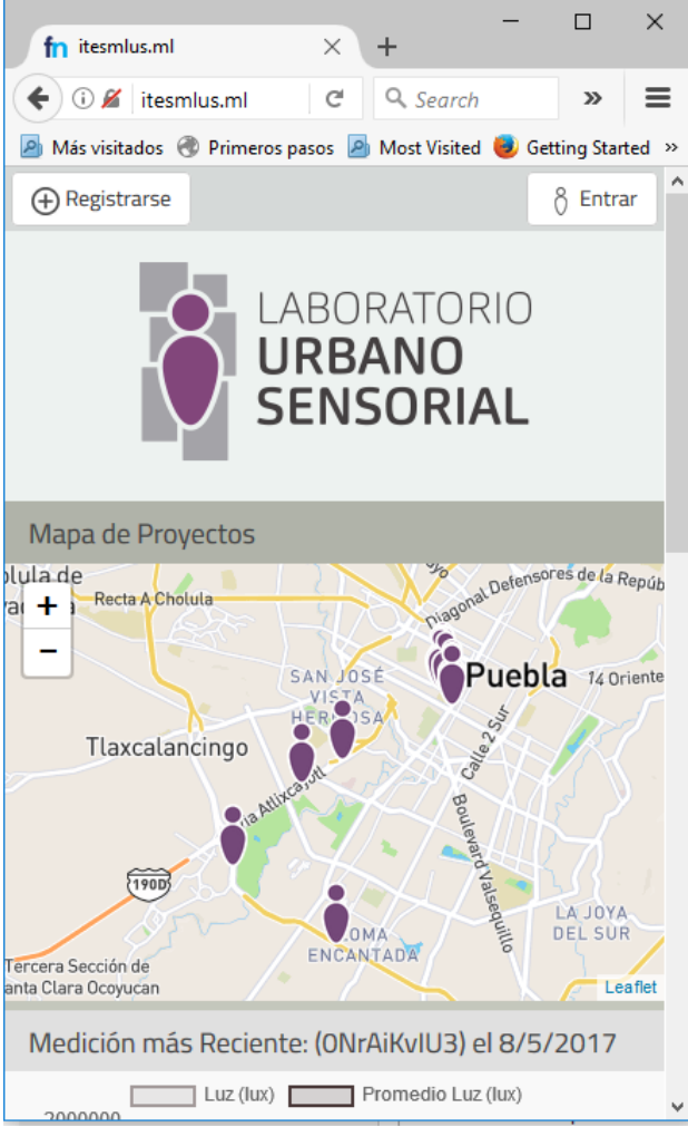
Fig. 3 USL Web Site: http://itesmlus.ml/