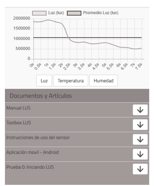
Fig. 4 Presentation of results

We have developed eleven experiments in Puebla, Mexico that are available on the web site. A first view of the results is presented in the Fig. 4.