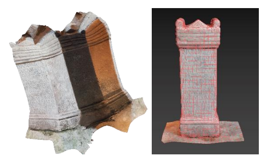
Figure 4. Texturizado y modelo en baja resolución. Ara votiva en 4k.