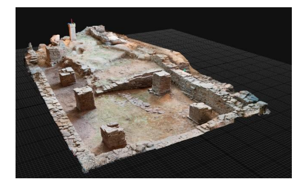
Figure 1. Optimized Model. 10.2 M triqs

Automatic minimization of polygons supported by the VR device may present problems such as open mesh and undefined areas.