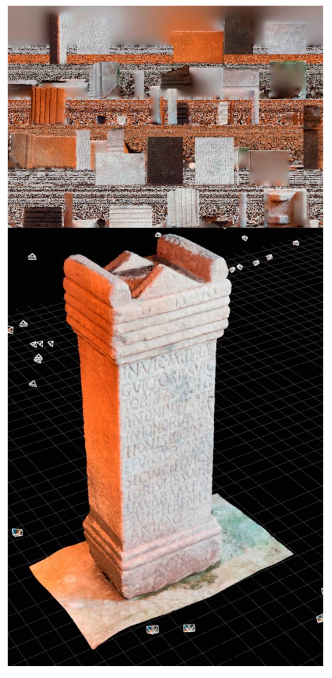
Figure 3. Texturing and high resolution model. Ara votive 12M triqs

The International Archives of the Photogrammetry, Remote Sensing and Spatial Information Sciences, Volume XLII-4/W6, 2017 4th International GeoAdvances Workshop, 14–15 October 2017, Safranbolu, Karabuk, Turkey