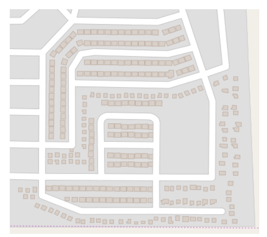
Figure 4. OSM screenshot showing building footprints added during the mapathon (map © OpenStreetMap contributors).

from other degree programmes, such as meteorology or geology. This was the first mapathon for all but one student. As a result, the majority of the students completed the iD editor tutorial before starting the given task. The number of mapped features differed significantly from one student to another. On average, students mapped 296 nodes; one student was able to map 1,516 nodes in the two hour time slot. In total, 8,289 nodes were mapped or updated, resulting in 75.12 km of additional roads and footpaths in OSM. Figure 4 shows building footprints added during the mapathon.