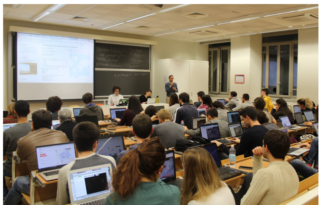
Figure 1. A picture taken during a humanitarian mapathon at Politecnico di Milano organized by PoliMappers.

the mapping activity. In addition, the number of attendees is limited since many students at Politecnico di Milano do not live in Milan and therefore they prefer to come back home just after the end of their lectures.