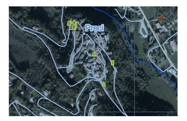
Figure 2. Grading map of the city of Preci

The Grading map shown in the Figure 2. is an example realized through a high-resolution aerial image acquired before the event compared with the higher resolution image acquired immediately after the calamitous event. The map portion shows the degree of damage to the area of the city of Preci with a visual interpretation made by some elements (colored polygons based on the degree of damage). Estimated final geometric accuracy is 1 meter or better, derived from the native resolution of aerial and satellite imagery used.