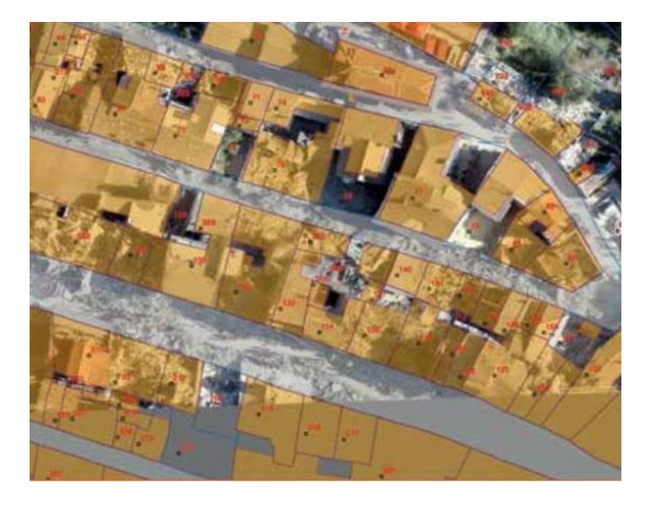
Figure 1. Example of cadastral data overlapping satellite image

At the request of the Civil Protection Department the cadastral cartographic data for buildings has been used and reworked in the framework of the European Copernicus program in support of damage detection on the affected edifices and its related mapping-based thematization.