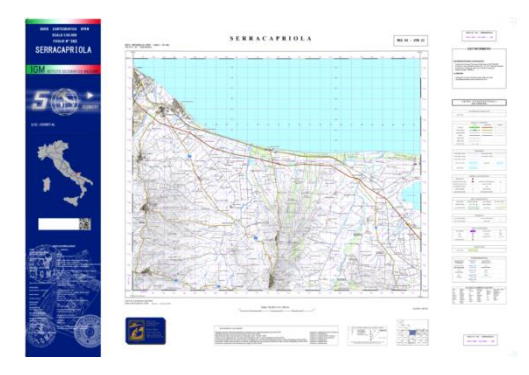
Figure 3. Example of 50_OPEN map