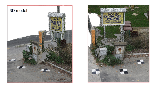
Figure 3. Application case of the proposed methodology [by A. Palummo]

The experimental data which we are referring to in this venue were obtained with a 25m flight altitude for a drone speed of 8 m/s (about one shot per second and a focal length of 35mm) for nadir shooting, and 10-15m for the inclined shots with a speed of about 12 m/s (shots every 3sec), with a maximum error in the order of a centimeter.