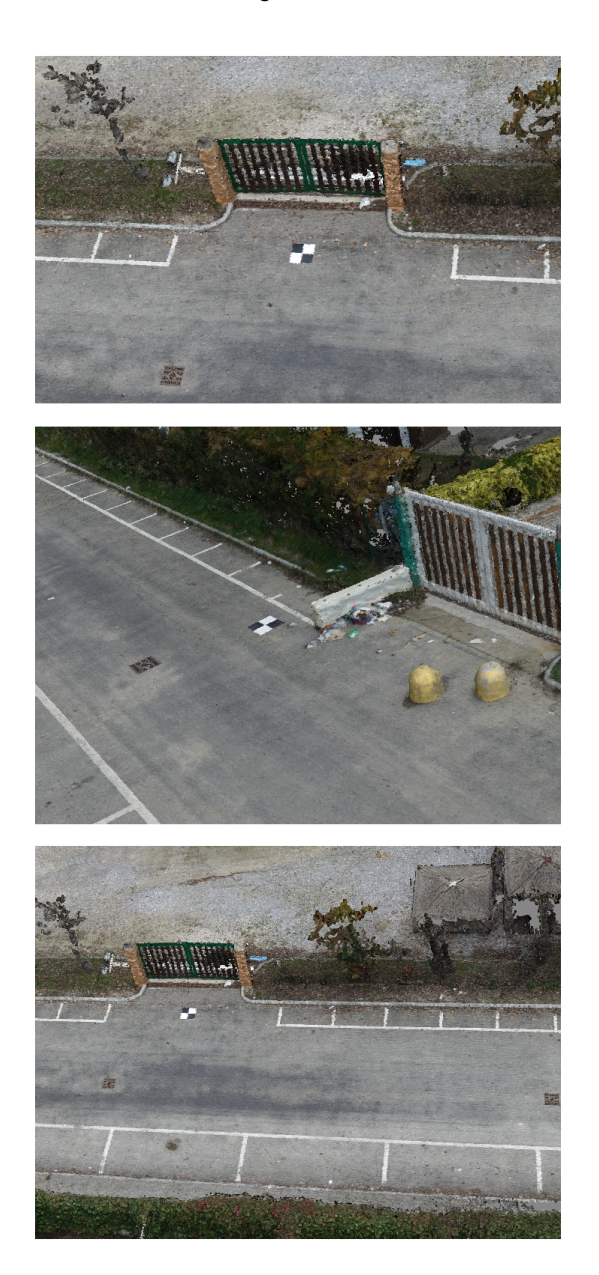
Figure 1. Example of a 3D model for UAVs road monitoring [by A. Palummo]

Traffic management is now of international interest because it is forced on to the political agenda by the increasing urbanization; an interesting case of photogrammetry from UAV in this sense is represented, just to give an example, by the Anglo-Iraqi study by Smith et al. (2013) in which the Road Surface Monitoring (RSM) supplemented by geo-tagging is used to detect potholes (Fig.1). Thinking about the Italian situation, given the widespread backwardness of the transport system, we felt it was more appropriate to think in more elementary terms and focus, rather than on the streets, on the traffic directing tools on the roads themselves: roads signs.