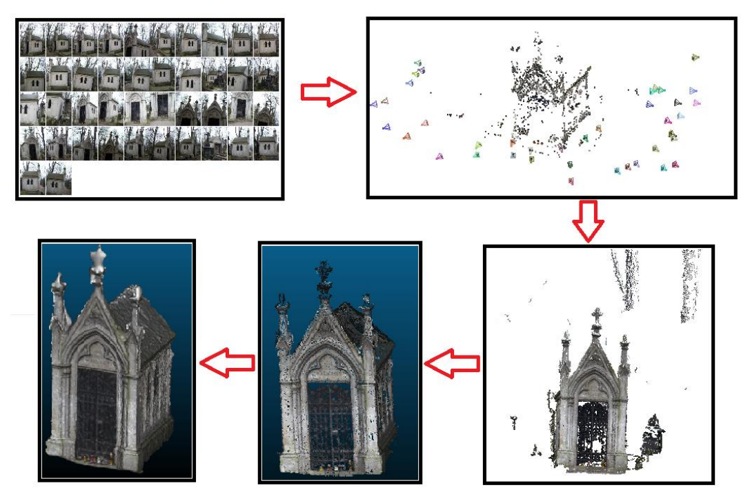
Figure 2. The process of generating texture of 3D model: 1. taking images, 2. sparse reconstructing, 3. dense reconstructing, 4. filtering and scaling, 5. surface reconstructing and texturing model.

without the need for a predefined set of ground control points (with known three-dimensional position). Incremental SfM is a successive processing with an iterative reconstruction component. It normally starts with feature extraction and matching, and next goes with geometric verification. The resulting scene graph serves as the basis for the reconstruction step, which selects the model with a two-view reconstruction. Then algorithm registers new images, triangulates scene points, filters outliers, and refines the reconstruction using bundle adjustment. Limitation of this solution is a need for a high degree of overlap to cover the full geometry of the object or scene of interest because a large number of corresponding points must be defined in each view. Additional complication is that there occur different kinds of degenerate structure and motion configuration for which the standard algorithms will fail (camera rotation without the translation, planar patches on the scenes, irregular lighting or points lying on a line passing through the optical centers of the cameras in which it is visible). In practice, it may be hard to avoid these kinds of defects, particularly if non-expert user obtains images.