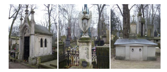
Figure 1. Objects selected for the research purpose.

For the research purpose, three tombstoneswere selected. The first wasa magnificent tomb with a complicated structure, resembling a chapel with a bright facade, the second one - was a gravestone with an angel statue made of stone, and a third - was aquite low tombstone with a visible metal roof and a stone pedestal. All of them are showed in figure 1.