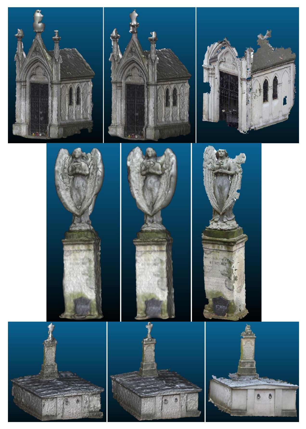
Figure 5. Resulting 3d textured models: left column: VisualSFM/CloudCompare, middle column: OSM Bundler/CloudCompare, right column: ARC3D