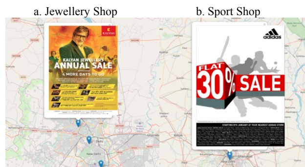
Fig 3 (a) Visualizing the jewellery shop which have offers in New Delhi, (b) visualizing the sports shop which containing offers.

The most popular Open Source JavaScript library to make interactive maps is Leaflet. Leaflet have all the necessary features that a developer need and its weight about 33 KB of JavaScript (Wang, Pi, Zhou, & Zhou, 2015). The offer locations were downloaded from PostgreSQL / PostGIS spatial table as geoJSON objects and visualized in leaflet with open street map as base layer. The corresponding advertisement images were added as pop up in the map so that user could view the advertised image when they hover over the Offer location. Figure 3 visualizes the shops in New Delhi which have Offers.