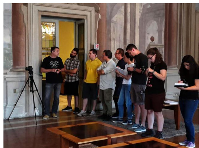
Figure 1. Close-range photogrammetry exercise during GEORES 2017 Preliminary Young Researcher Workshop.

Since many years it has been pointed out that such data can be used for the documentation of cultural heritage, both by using, for example, the photos that countless unaware users have shared on the Internet (Agarwal et al., 2011), both by stimulating the curiosity and active participation of the population for projects on recording and documentation of cultural heritage (Letellier, 2015).