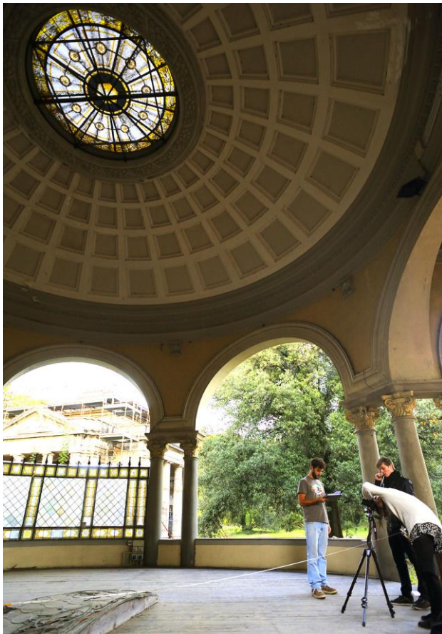
Figure 2. Student's exercise at Montecatini Terme for the "Geomatics for restoration" course, School of Architecture, University of Florence, 2014.

These initiatives can use geomatic techniques with different levels of complexity, from simple geotagged 2-D photos to 3-D models generated with photogrammetric Structure-from-Motion techniques on the same device, on the Web or using external software.