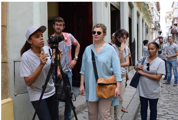
Figure 5. An example of life-long education experience: hands-on photogrammetry workshop in Havana during the Innova Cuba project, 2018.