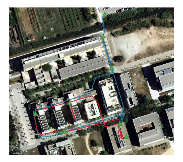
Figure 3. Walking paths for the tests. The GNSS path is shown in blue while the VIO test path is shown in red.

Two different tests were performed (Figure 3), to evaluate the Visual Inertial Odometry solution provided by the T265 tracking camera and to the assess the potential of an already available low-cost, low consuming GNSS receiver embedded into a Quectel BD96 board.