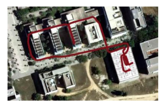
Figure 4. VIO trajectory

A graphic depiction of the positioning results from the VIO device and those from a single GNSS receiver can be found in Figure 4 and Figure 5 respectively. A preliminary analysis of the performance shows that the VIO solution can deliver outdoor/indoor positioning with a planimetric RMSE of 3.0 m and 3.3 m (Figure 4) for a walk of about eight minutes. The mean of the relative error of the elevation is 1 m. Such value has been computed using two points only. Therefore, its significance is not high.