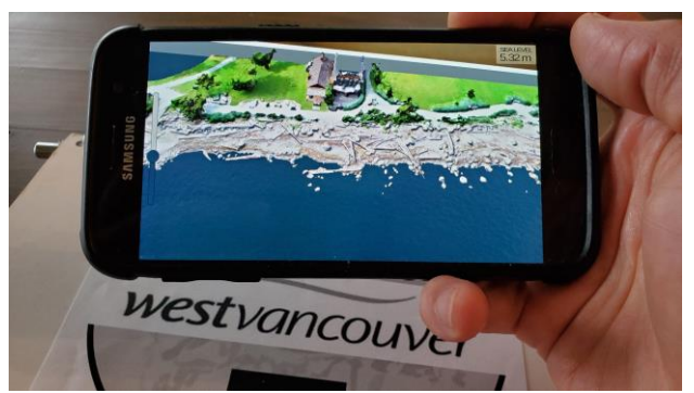
Figure 5. Our interactive tabletop AR prototype – allowing on-the-fly control of a moveable sea surface intersecting with 1cm resolution intertidal zone.