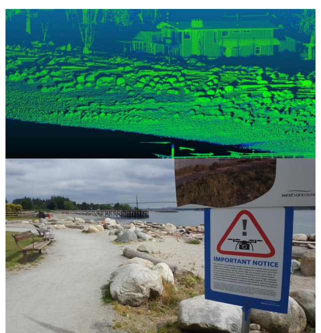
Figure 1. Images from our data survey campaign. Top: view of raw point cloud captured during terrestrial laser scanning of intertidal beach environment. Bottom: in partnership with local municipality and with authorization from federal aviation authorities, we conducted airborne imaging, which we processed using Structure-from-Motion methods.

We pursued a multi-phase project, to develop and explore these workflows. First, we conducted a multi-faceted 3D coastal/intertidal capture and characterization campaign, using laser scanning, and photogrammetry (Figure 1).