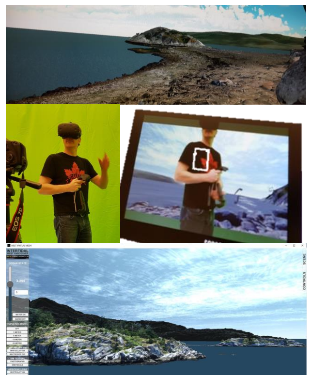
Figure 4. Views from inside and outside of Intertidal VR – and immersive virtual reality system allowing municipal planners and citizens to walk around a 1cm-resolution virtual intertidal space, and interactive control total sea-level (with segmented mean sea-level, storm state), and not just observe, but experience its potential impact on a familiar community coastal space.