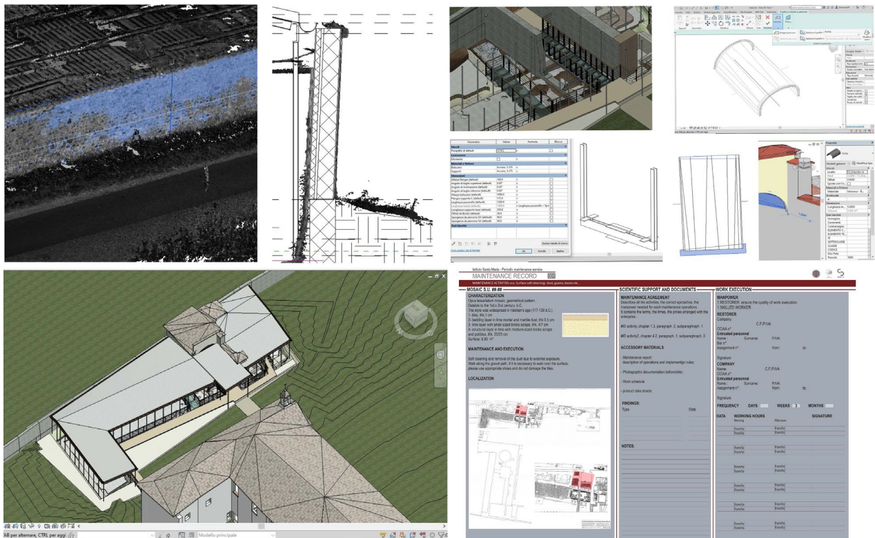
Figure 1: The design of the archaeological area next to the monastery of Santa Maria in Castiglione. The point cloud and the extraction of profiles (top, left), the modelling stage of complex element (top right), the architectural design of the new coverage (bottom, right) and the card for the planned conservation (bottom, left).

and photogrammetry, both terrestrial and from the drone, will be the main topics. Together with them, we will focus on the survey project and, more precisely, on the need to establish a reliable and durable reference system (through a topographic network), which is essential to deal with the documentation phase but also for the construction site and subsequent maintenance. The collaboration with instrument manufacturers will be essential to offer participants the latest technologies (such as SLAM-based systems). Attention will also be drawn to the relationship between precision, accuracy, object size, and BIM objectives, which is necessary to correctly design the type of documentation.