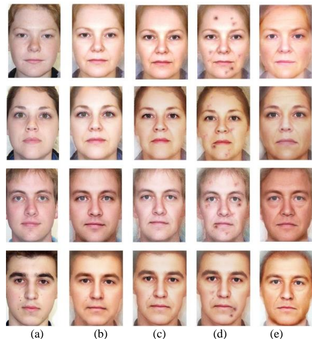
Figure 2. Results of applying predictive models to compare. (a) Input image (b) Output of applying natural ageing model (c) Outputs of applying the behavioural model for Methamphetamine addicts (d) Outputs of applying the behavioural model for Methamphetamine addicts if consumption continues for a longer time. (e) Results of applying the behavioural model for the sun-seeking people – The output age range for all the results is 41-50 (Farazdaghi and Nait-ali, 2017).

3.5.1 Smart Healthcare: One of the interesting applications of gait analysis is gait-related pathology. Gait analysis can help the healthcare system in two different ways. First, it can help to diagnose gait-related disorders. Then to monitor the process of the treatment and rehabilitation such as in cerebral palsy children or any patient with a walking disorder. This kind of healthcare systems can compensate for clinical deficiencies and give consistent diagnoses and assessments of treatments to the patients (Boyd and Little, 2005). Gait recognition can also be used in the home security systems for elderly individuals, to track their walking and detect if they fall and send alerts to the emergency numbers.