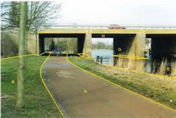
Figure 1: Relative height information as available in the BGT. The bridge (H) is at relative height level '1'. The bridge-parts F and G as well as the road, verge and water are at relative height level '0'. The latter form a planar partition (IMGeo, 2020)