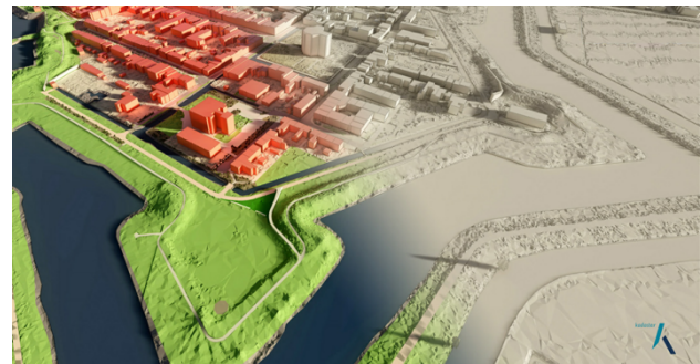
Figure 5: Visualisation of 3D Basisbestand Volledig as available from PDOK

The first product (BGT surfaces with LoD1.2 buildings) has recently been published via the governmental portal (PDOK-3D, 2020). See figure 5.