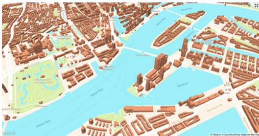
Figure 3: Visualisation of reconstructed LoD1.3 buildings

The LoD1.3 building reconstruction method uses the point cloud to find lines at the location of height jumps. These lines are used to subdivide the footprint polygon of the building into roofpart polygons. Each roofpart is assigned an elevation value equal to the 70 th percentile of the roofpoints it contains.