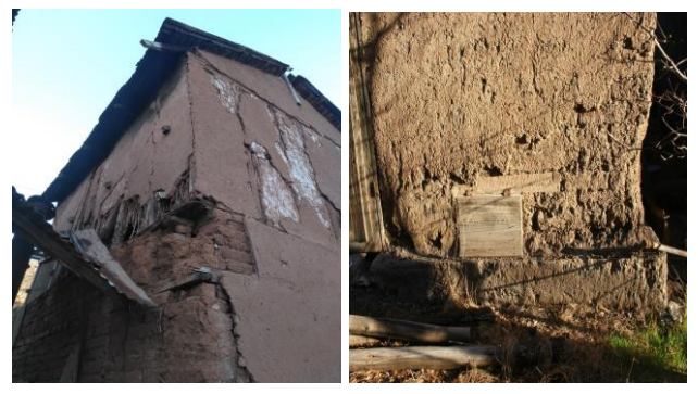
Figure 9a. Erosion in a. upper area of an adobe wall in Chalinga b. lower area of an adobe wall in Chuchiñi.

4.2.2 Material loss : Material loss is a general classification of three particular damages: plaster loss, erosion and voids. While the first is common to all studied furnaces -triggered either by environmental or mechanical factors affecting adherence to different surfaces such as adobe blocks or wooden structural elements - erosion affects mostly adobe structures in their lower or upper areas and it is due to water infiltration or splatter. This damage rarely compromises structural stability of studied cases.