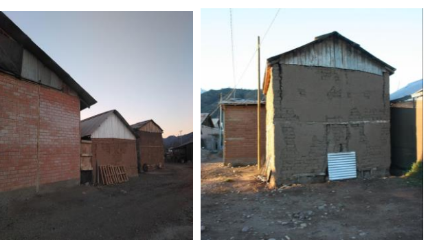
Figure 7. Lowered furnaces in Chuchiñi.

Many furnaces were disassembled by their owners in order to make more space within their plots, reuse materials or prevent them from naturally falling down due to lack of maintenance.