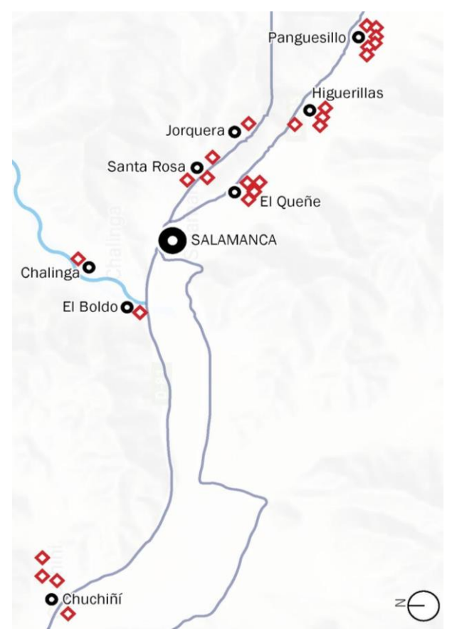
Figure 1. Location of the 24 studied ensembles (in red) within settlements of the commune of Salamanca (in black).

The present article compiles information referred to 24 furnace ensambles, located in seven different sectors of Salamanca. This information is gathered during fieldwork developed in April of 2019, through photographical surveys and in-situ assessment of their state of conservation. This is complemented with other information previously produced by the local government of Salamanca, which included basic architectural drawings of some furnaces and interviews with different owners (Olivares, 2018). Other complementary sources of information are the detailed drawings and group interviews to local historians, politicians and other members of the community, carried out by teachers and students of the post-graduate Diploma on Earth Building of the Pontificia Universidad Católica de Chile in August of 2019.