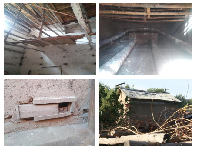
Figure 2. Mechanical features designed to enhance tobacco drying. a. Poplar logs were used to hang tobacco leaves b. Iron tubes conducted hot air through the furnace c. Wooden portholes controlled air intake in the furnaces d. Ridges could be lifted mechanically to allow for better ventilation.

Architectural plans were rectangular, measuring approximately 6 by 7 meters. The walls were about 6 meters high, while the ridge could rise up to 8 meters above the ground. Furnaces would usually have one or two doors to introduce and extract tobacco plants and a single window located on the upper part of the enclosing walls. This window, along with other mechanisms, such as mobile ridges and wooden portholes on the lower area of the furnace, allowed for ventilation and a better control of humidity and heat conditions.