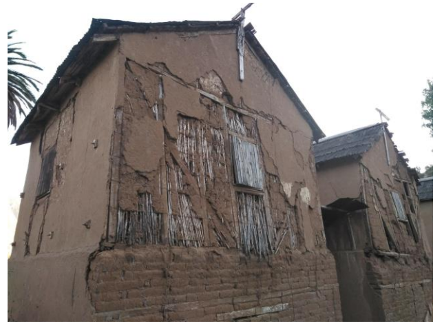
Figure 6. A singular case of 'quincha' in Chalinga. The lower area is built with adobe.

3.2.3 'Quincha': A third technique found in the area is the branch-filled 'quincha'. This is another hybrid wood-earth technique, in which the bearing structure is made of wood. Variations within these structures are similar to those found in furnaces built with 'tabique de adobe en pandereta'; with the difference that 'quincha' walls are not filled with adobes but with a combination of medium-sized vegetable fibers and earthen plasters. This technique was only observed in the upper level of one of the studied furnaces (Figure 8) and in minor elements such as gables in other studied cases. In the first, fibers correspond to tobacco branches, which are confined externally with horizontal metal wires and then covered with earthen and wheat straw plasters (Figure 5d).