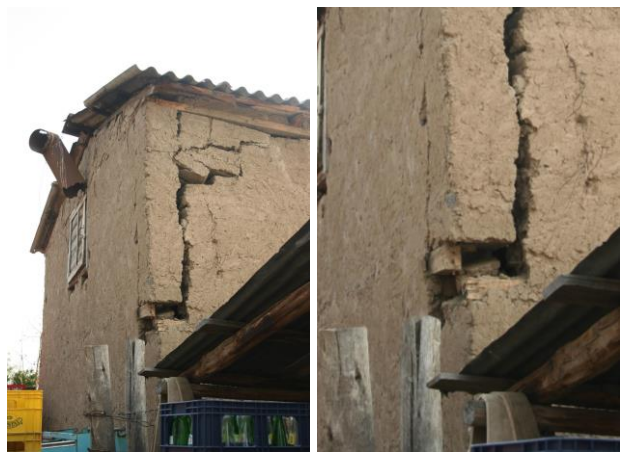
Figure 8. Crack in a furnace in Panguesillo, associated to poor links within its horizontal wooden reinforcement.

4.2.1 Cracks: Those which compromise the structural capacity of furnaces appear mostly on adobe walls. Severe inplane cracking of the walls was observed in some cases, particularly in those where horizontal wooden reinforcements were not present or deficiently designed - with poor link between the wood elements and insufficiently distributed in their total height (Figure 8). Cracks appear most commonly in corners and in higher parts of furnaces, particularly in adobe gables.