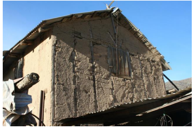
Figure 4. 'Tabique' furnace in El Queñe with one horizontal block between the sawn wooden elements and horizontal wires.

confined with metal wires. These are nailed to the main wooden structure on their outside and inside to keep adobes from falling from the wall's axis. Wooden structures present variations within the studied cases, both in the geometry of the wood and in its section and structural logic. In the particular case of El Boldo, for example, two furnaces belonging to a same ensemble are built using different techniques. The first of them was built with unsawn wood, which shows natural irregularities in a pile and beam system and in which acacia pillars were directly buried into the ground. The second example is erected with sawn upper, lower and diagonal hearths of poplar (Ventura, p.c., 2019)following an adapted balloon frame system with concrete foundations. This system is found more commonly than the first throughout the studied areas (Figure 4).