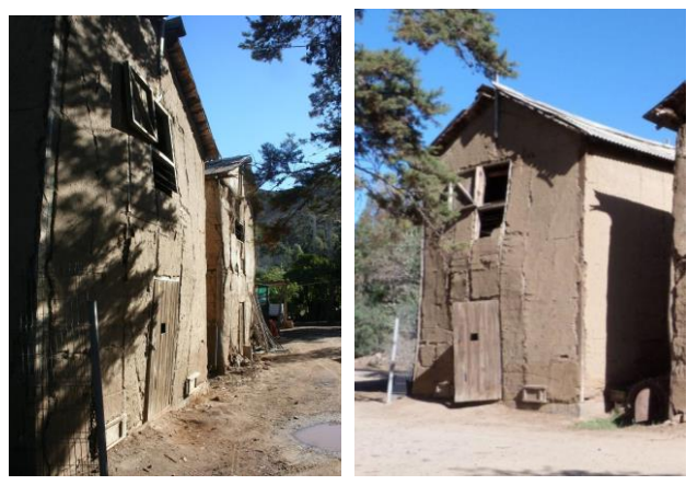
Figure 10. Severe deformation of a tabique wall associated with an inappropriate choice of wooden joints in pillars - Furnace in El Boldo.

Another recurrent issue detected in the deterioration of wooden structures is the poor choice of wooden joints in some specific cases, which lead to major deformation of walls (Figures 8 and 10).