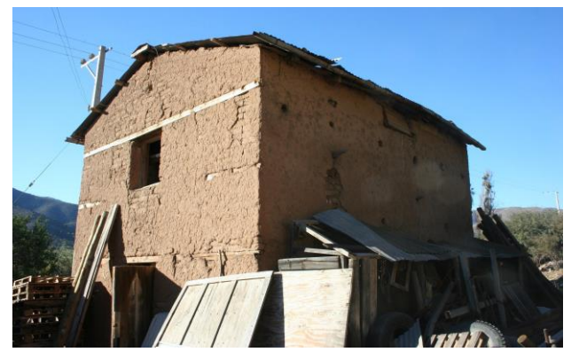
Figure 3. Adobe furnace in Chuchiñí, in which both continuous and corner horizontal wooden reinforcements can be identified.

Nevertheless, these cases recurrently incorporated horizontal wooden elements. These elements are set between adobe layers at different heights, either wrapping the whole perimeter of the construction, or just reinforcing corners. They are materialised differently in each of the studied locations - mostly through a different amount of reinforcements per furnace and different wood sizes and joints in each element - and would help to counteract large slenderness ratios, therefore contributing to the better seismic performance of these buildings. Damage due to biotic or anthropic factors in these wooden reinforcements is found to be related to the general conservation of furnaces and to severe damage in adobe walls (Figure 8). In parallel, poplar logs used to hang tobacco leaves were frequently anchored directly into adobe walls (Figure 2a). This thick concentration of horizontal links between parallel planes of furnaces would have also mitigated the effect of high slenderness ratios.