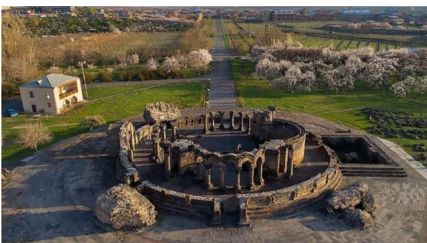
Figure 3. Cathedral of Zvartnots.

The ruins of once colossal and one of a kind Zvartnots Cathedral (Figure 3) are situated 4-5 km to the West to the Cathedral of Echmiatsin. It took almost 20 years to build the church (643-652).