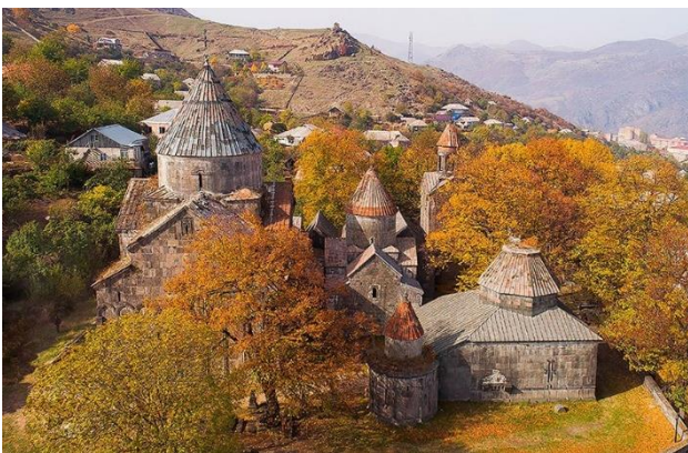
Figure 5. Monastery of Sanahin.

The Monastery of Sanahin is located in the northern part of Lori Province. The Monastery complex (Figure 5) was founded by the King Abas Bagratuni in the 10th century (940-950). It took 300 years to finish the construction of the whole complex.