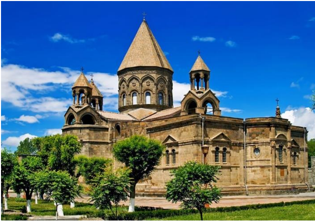
Figure 2. Cathedral of Echmiatsin.

It is believed that St. Gregory the Illuminator had a vision of Jesus Christ descending from heaven and striking the earth with a golden hammer in order to show where the Cathedral should be built. Hence, the patriarch named the church "Etchmiadzin", which translates into " Ijav ([իջավ] - the Descent of) miatsiny ([միսածինը] - the Only Begotten, Son of the God)," (Wainwright and Westerfield Tucker, 2006).