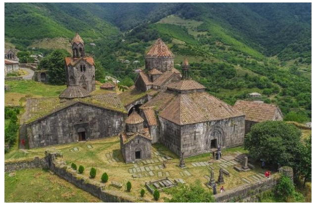
Figure 6. Monastery of Haghpat.

The Monastery of Haghpat (Figure 6) is located near the Monastery of Sanahin in the Haghpat village. It was founded in the 10th century (947-991) by the King Ashot III the Merciful, who was the son of the King Abas Bagratuni.