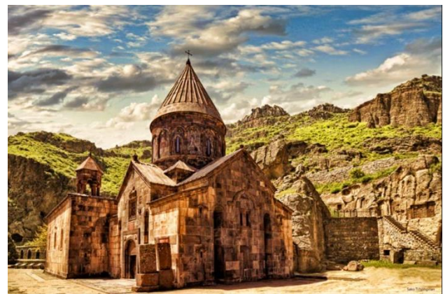
Figure 4. Monastery of Geghard and the Upper Azat Valley.

The Monastery of Geghard (Figure 4) is situated in Kotayk province, at the head of the Azat valley, surrounded by towering rock cliffs. According to a popular belief, it was founded by St. Gregory the Illuminator in the 4th century at the site of a spring in a cave (Tovmasyan, 2016).