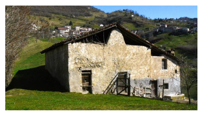
Figure 2. Farmhouse Marmentino, Brescia (Italy)

On the ground floor there was also a room with a fireplace used as dining room and to host the shepherds, while upstairs there was a room for sleeping, often only one big room for everyone. The masonry is in hewn stone with lime mortar joints (usually found in local limestone quarry), which sometimes cover the surface of the stone with a smoothing effect. Near the river 'Mella' that runs through the valley, the masonry structure is basically made of megalithic rocks (used for the foundations) and smaller pebbles collected directly from the river.