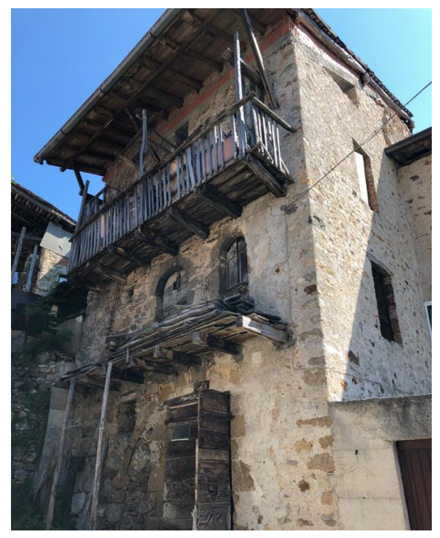
Figure 1. Farmhouse in Magno di Bovegno, Brescia (Italy)