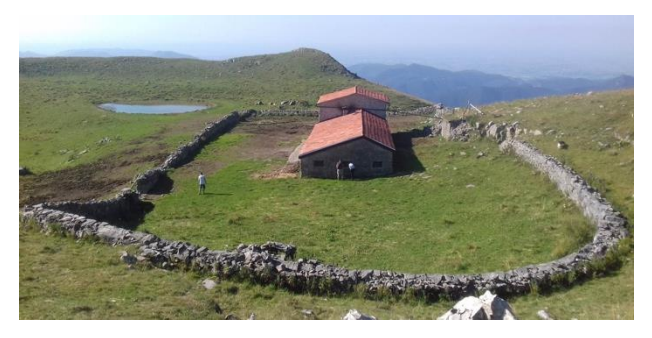
Figure 4. Farmhouse called 'Malga Due Signore' in Tavernole sul Mella, Brescia (Italy)

Along the slopes of the upper valley we can observe the presence of alpine huts (Figures 4 and 5), located at different altitudes according to the routes and times of transhumance.