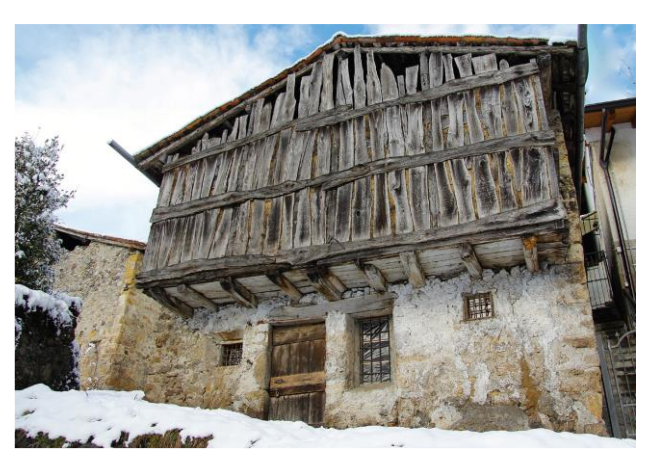
Figure 3. Barn in Ludizzo, Bovegno Brescia (Italy)

The ceiling and roof structure have a main and secondary beam levels generally made of wood, above which are laid axes and rafters made from branches and trees of modest size. The pitch of the roof, covered in terracotta, shows consistent inclinations that sometimes reach the ground level. The eaves are usually made of wood and have a limited span/diameter, in order to facilitate the entry of light in the interior spaces.