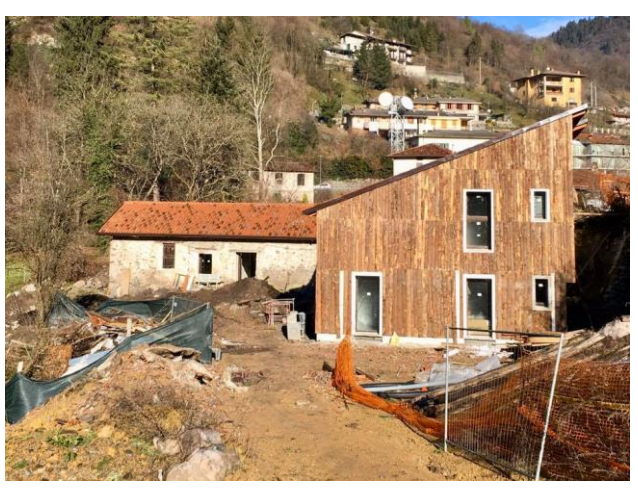
Figure 12. The masonry is covered in wood 'peels'.

In order to follow the paths already started in other calls for proposals by the Cariplo Foundation, at the end of the works the building will be provided with a planned conservation project of the building, guaranteeing a monitoring phase over its correct use. In this phase an HBIM model of Building B is being run-in in order to continue the experiments already carried out in other sectors.