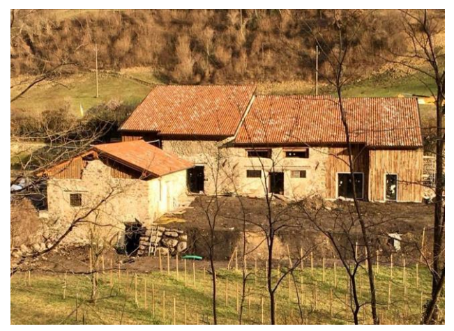
Figure 13. The masonry is covered in wood 'peels'.