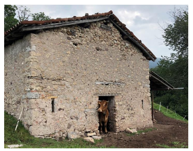
Figure 5. Farmhouse in Bumaghe, Bovegno, Brescia (Italy)

The huts are made of stone and plastered with lime mortar; they have lintels, floors and roofs in wood and a roof made of tiles. The openings of the rooms are usually small because they need to prevent the sun from entering and making therefore the milk processing rooms too hot, but at the same time their presence ensures ventilation and cooling of the spaces.