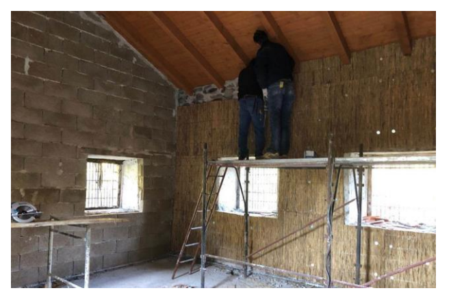
Figure 11. Isolation with bamboo reeds.

As far as the electricity supply is concerned, we have remained tied to the suppliers of the area. In the meantime, some proposals have been subjected to the Province offices for the installation of hydroelectric power plants, which are widely used in the area. A priori, the installation of photovoltaic panels has been excluded not only from an aesthetic point of view but also due to the verified inefficiency of the plant in this area, where the sun shines only for a few hours during the summer days and almost never during the winter season. The finishes of the annexed portion have been studied to make it harmoniously integrated with the building complex: the masonry is not made of stone but there is a covering in 'peels', wood claddings laid in the same way as those found in the farmsteads (Figure 12).