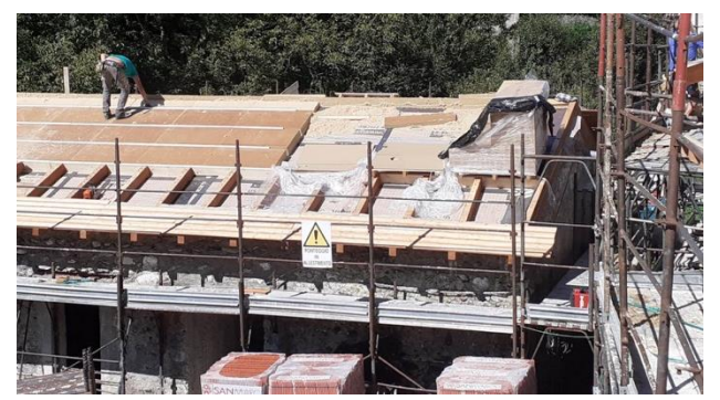
Figure 10. Example of an intervention data sheet.

The doors and windows, when present, have been preserved or integrated (if there was no glass) and supported by a second internal window and door, laid inside the opening.