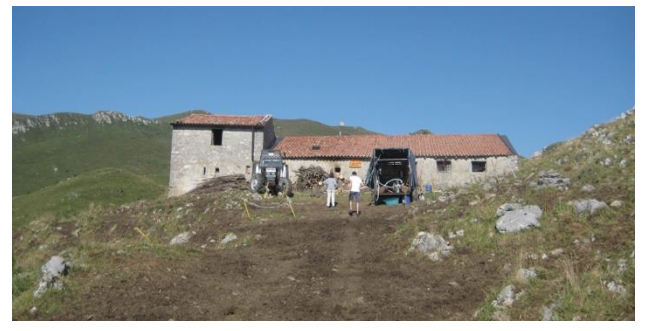
Figure 7. Farmhouse called 'Stalletti alti' in Tavernole sul Mella, Brescia (Italy).

A specific in-depth study, based on the map documentation found in the historical cadastres/registers kept in the State Archives of Brescia and Milan and available online, was aimed at assessing the time of construction and at identifying any changes in the rural heritage under study.