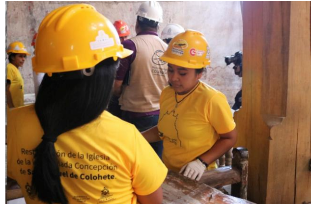
Figure 5. Community volunteers of San Manuel de Colohete working in preventive protection of the polychrome wood in the inside of the church during a guided tour.

In the same way, in the case of San Manuel de Colohete, the visitors who attended the first phase of the work were able to observe the support work done by volunteers from the local community. At that time, there was a group of young volunteers who carry out preventive protection of the polychrome wood in the church (Figure 5). The group was trained as part of the project's training guideline and the technical work team guided the group during the practices. As mentioned above, this is another example of the close relationship between the strategic guidelines of the project.