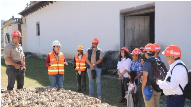
Figure 4. Guided OR program tour to regional media at the first period of restoration works in San Manuel de Colohete.

Dissemination of the program: For the first time in Honduras a guided tour program is implemented during a restoration worksite of these characteristics. In order to disseminate it, regional and national media are called upon to tell the initiative known to as many people as possible. The call is divided into groups at different times of the work and the visit is made with all the technical team (Figure 4).