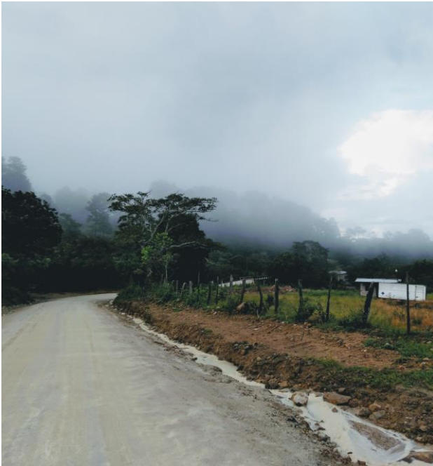
Figure 1. Dirt road between Gracias, San Manuel de Colohete and San Sebastian after a storm (October, 2019).

4.2.3 Cultural factors: The cultural context is a determining factor on which a project depends. In this case, the rural area is closely linked to subsistence agriculture. The available labour force depends on the planting and harvesting seasons.