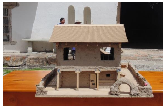
Figure 5. b) House designed for the consolidated context.