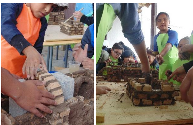
Figure 2. c) construction of the chapel arch, d) construction of walls (leveling, interlocking)

Another session focused on structures and finishes: each piece of wood has a role to play; Susudel's children learned about the way structures work and their assembly process. It was essential to improvise a small carpentry workshop on site, to prepare the structural pieces and furniture. For the finishing of walls, the children organized themselves autonomously, to be able to produce fine earth by means of sifting and then the production of a fine and consistent paste.