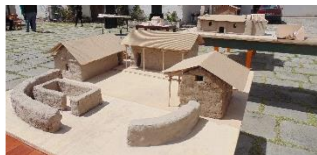
Figure 6. c) House designed for the agricultural area.