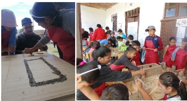
Figure 2. a) foundation construction, b) working groups.

The dynamics were developed combining game and learning. In these an explanation was offered of the construction systems and construction processes in vernacular architecture. Cementing: through a participatory process that included collecting small stones to stick them in the foundation area or, in other cases, draw them. The objective was to promote construction with materials from the environment, stimulating the creativity of the children; Walls: these were raised with small bricks. The children learned the processes of leveling bricks, the importance of interlocking bricks and corner solutions; They tested the use of earth mortar for laying bricks and how to anticipate the presence of openings, among other activities. In addition, assuming construction challenges, more complex structural principles were addressed with the construction of the transverse arch of the chapel. This was one of the challenges that surprised the participating children intensely: they never knew or imagined how an arch is constructed, but with a didactic explanation, a solution was reached among all (Figure 2).