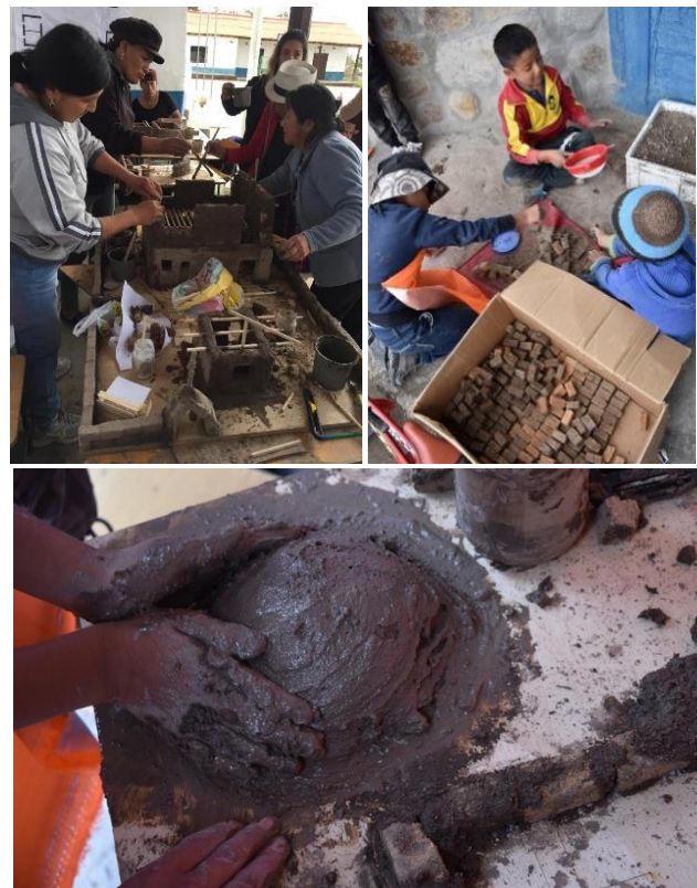
Figure 3. a) integration of adults to the workshop, b) laborious hands in the sifting of earth. c) missing photo of the mud noque.

Experimentation was key in the project and turned it into a playful experience in which adults were gradually included. Experiences also came from home: one of the children built a noque 7 which he had seen his father do in front of a construction with earth (Figure 3).