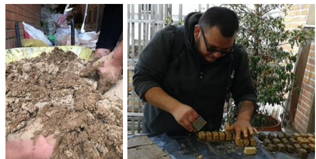
Figure 1.- Process of making bricks on a smaller scale. Author: Gabriela Barsallo 2018.

The manual production of approximately 5,800 small bricks (4x2x2 cm) had an interesting process, for which a small production workshop was set up at the University of Cuenca; Several production dynamics were studied with serial and individual production molds, taking as reference a generic mold that makes it possible to obtain several small bricks. To do so, different activities were carried out: wooden frames were prepared for mass production as well as aluminum molds to define the rectangular shape of the small bricks; The raw material (sifted earth and generated mix) was prepared. As can be seen in figure 1. after manufacturing, the pieces, as in real production, followed their drying process and then were organized and packed for transfer to Susudel.