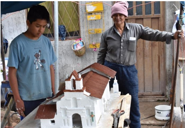
Figure 7. Four months after the workshop, a boy appeared with his own chapel.

He recovered the plans and the bricks that were left over from the July workshop, and little by little, without any advice, he managed to build a model of the Susudel church. Apparently, the Workshop saw the birth of a new architect! (Figure 7)