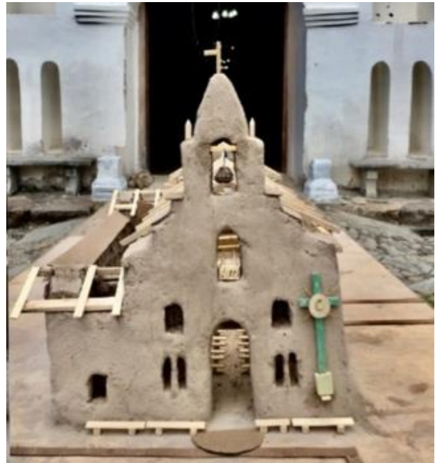
Figure 4. a) The community chapel.