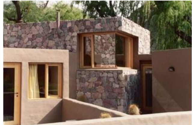
Figure 5. Details in one of the hotels of Purmamarca © Authors.

Although academic and institutional views built on the architecture of the area focused mainly in the consideration of colonial productions, there has been also a sustained interest in observing the particularities of vernacular architecture. Speeches, in general, valued an apparent harmony of this architecture with their natural environments, associated with the use of raw materials from the same sites and constructive earthen techniques (Tomasi, 2012). The idea that can be extracted from these readings, such that this architecture were almost emerging from nature, operated by man only to cover his primary need for shelter, was functional to the preferential valuation of certain elements and the denial of others, enterprise that was sustained from the beginning of the 20th century until today. Thus, these discourses valued the use of certain materials and resources primarily in aesthetic terms, overlooked other aspects of architecture that have to do with its productive and social frameworks. Spatial organization of houses around a patio, dimensions of enclosures and their openings, specificity of constructive techniques and aesthetics of local senses in the domestic sphere and their practices, far from being valued, formed part of those other speeches that sought to eradicate local architecture based on a modern project (Barada, 2018).