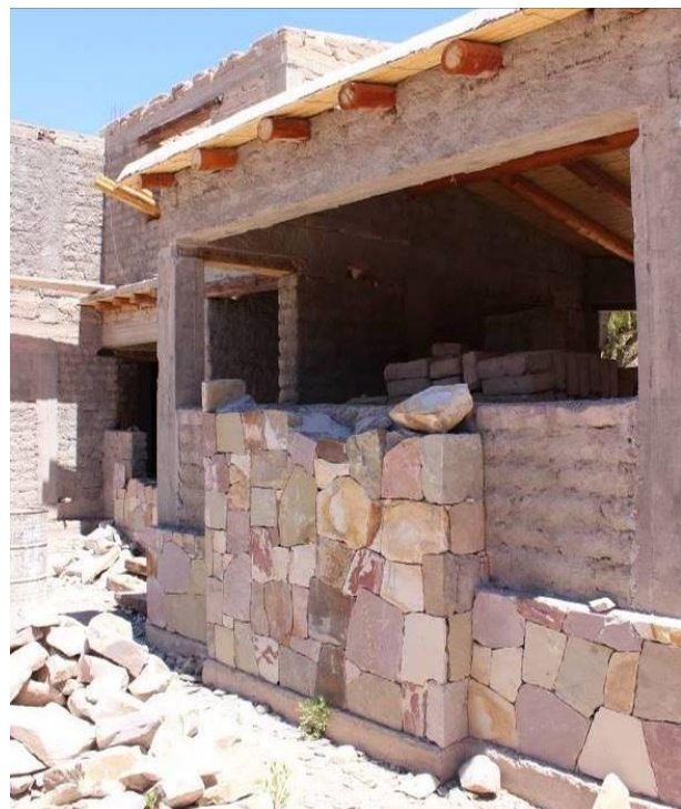
Figure 8. Stone finishing in a house in Tilcara © Authors.

In this context, both private actions and regulations operate based on the preservation of a heritage whose characteristics consider the careful selection of elements, and even the simulation of some others, which supposedly belong to local tradition. Thus, discourses associated with new architecture produced in the Quebrada de Humahuaca repeats concepts that derive from those first ideas that valued vernacular architecture of the area based on an assessment of certain elements that were functional to discourses strongly permeated by romanticism and exoticism. Expressions such as: “the rescue of the traditional”, “recovering the essence of the local”, “integrating with the landscape”, “maintaining harmony with natural environment”, are frequently used from the advertising scope, but also from media and institutions. This has been functional to the valuation of an architecture that use several aspects of vernacular one to build a tourist aesthetic focused on the sale of exoticism (Belli et al., 2005). Expressions about project decisions associated with this partial interpretation of the vernacular are the ones that professional architecture decides to ‘safeguard’ from materializing in the choice of certain materials or constructive forms, stripped of their meaning.