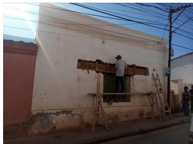
Figure 10. Adding a concrete lintel in an historic house in Tilcara © Authors.

This operation is exactly opposite to those promoted and carried out from professional architecture and heritage conservation projects, depending on the care of the desired heritage, masking the concrete by mud. Obviously this back and forth process constitutes a risk for the preservation of certain forms and constructive techniques historically