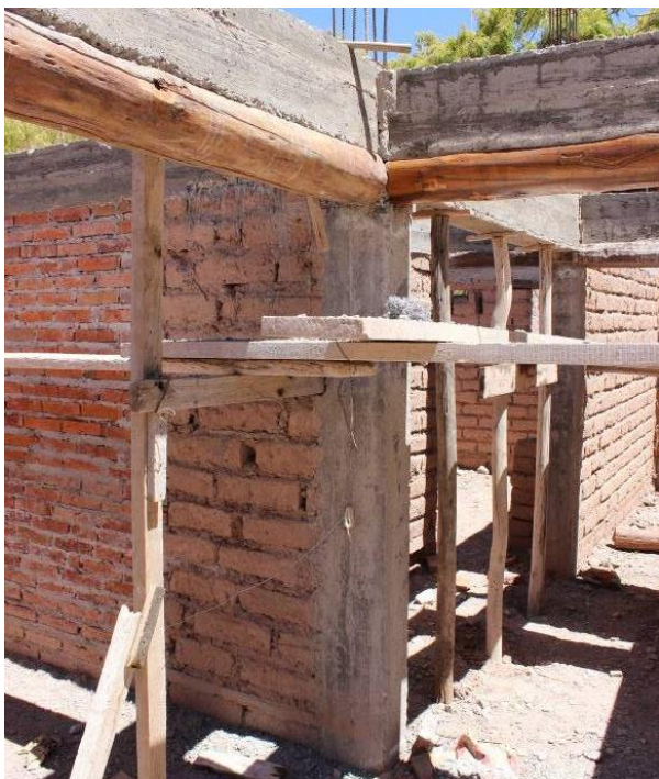
Figure 7. Wooden brace placed below a reinforced concrete beam in a new house © Authors.

In this fragment, tension referred is visible, with an architectural response that is fundamentally resolved through individual mechanisms, in a private work. Nevertheless, those mechanisms operate in the same sense on heritage than the previous discourses. In this way, this architecture produced as tourist infrastructure, beyond their variability, have ‘a certain family air that allows them to be grouped together’ (Tomasi, 2011b, p. 67). ‘Ceilings are low because the reference measure is man and the need to give shelter (...) the outdoor environments maintain the choice of simple and practical materials that adapt to the characteristics of the place’ 3 , says the same journalistic note. The ‘human’ scale and exterior finishes seem to be one of the main concerns of this architecture that seeks to ‘revalue’ local heritage. In relation to both issues, apparent harmony with the landscape attempts to be reproduced. For this, concrete plasters are painted in brown colors, pieces of wood (cactus wood) and stone coverings try to mask the reinforced concrete lintels over the openings, and clay roofs are covered in concrete and repainted with reddish membranes. As Troncoso (2013) has stated, new professional architecture receives a ‘vernacular architecture bath’ in its finishes (Figure 8).