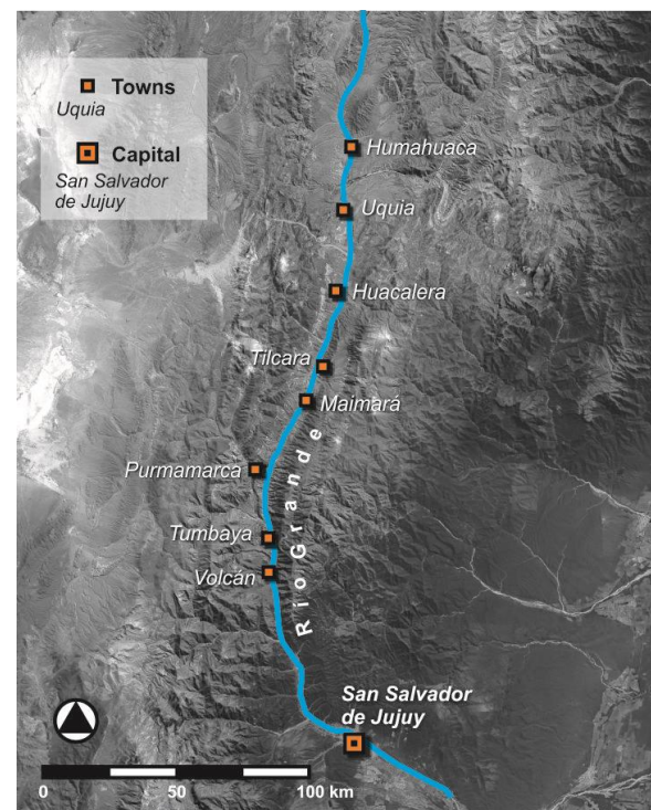
Figure 2. Quebrada de Humahuaca with some of its main towns © Authors.

On the other hand, interests expressed in the nomination were oriented to architecture, but not to the set of techniques associated with its production. These starting points, added to the lack of an effective Management Plan, entailed a series of significant risks due to the static conceptualization of practices and architecture intermingles without protection tools.