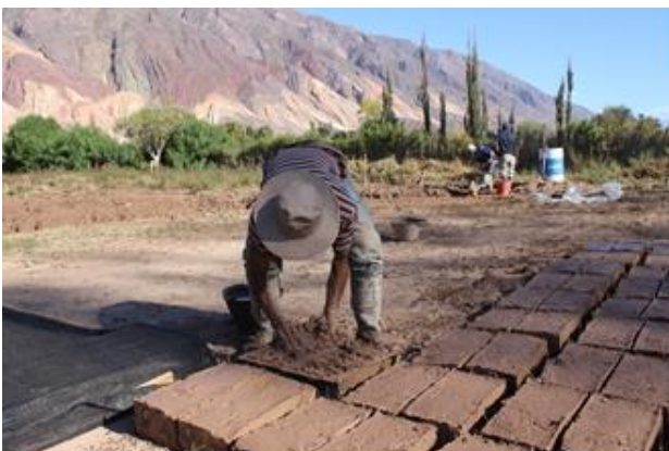
Figure 9. Adobe production in the town of Maimará