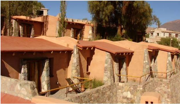
Figure 6. Residence complex in the town of Tilcara © Authors.

In this fragment, tension referred is visible, with an architectural response that is fundamentally resolved through individual mechanisms, in a private work. Nevertheless, those mechanisms operate in the same sense on heritage than the previous discourses. In this way, this architecture produced as tourist infrastructure, beyond their variability, have ‘a certain family air that allows them to be grouped together’ (Tomasi, 2011b, p. 67). ‘Ceilings are low because the reference measure is man and the need to give shelter (...) the outdoor environments maintain the choice of simple and practical materials that adapt to the characteristics of the place’ 3 , says the same journalistic note. The ‘human’ scale and exterior finishes seem to be one of the main concerns of this architecture that seeks to ‘revalue’ local heritage. In relation to both issues, apparent harmony with the landscape attempts to be reproduced. For this, concrete plasters are painted in brown colors, pieces of wood (cactus wood) and stone coverings try to mask the reinforced concrete lintels over the openings, and clay roofs are covered in concrete and repainted with reddish membranes. As Troncoso (2013) has stated, new professional architecture receives a ‘vernacular architecture bath’ in its finishes (Figure 8).