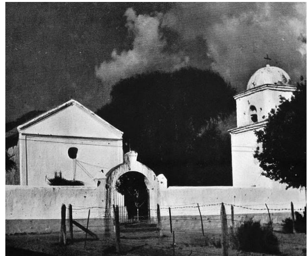
Figure 3. The Church of Uquía in a photograph from 1939.

Church of Uquía, in Quebrada de Humahuaca and located in the town of the same name, is relevant for this analysis not only for the first conservation actions in the last century, but also for recent ones. It is a chapel built in 1692, within the framework of the colonial processes of population reduction in Pueblos de Indios (Sica, 2016). It presents a single nave with an exempt tower attached to the perimeter wall that delimits the closed atrium. As already mentioned, it is a National Historic Monument in 1941, along with other chapels in the region (Figure 3). At an early stage, it had a first not documented intervention of an important scale, which can be located around the time of its declaration. Comparison between historical photographs allows to recognize how in those works the top of the tower, that was originally an adobe dome, was modified to erect a pyramid built with reinforced concrete. Beyond morphological alteration that affected the authenticity of the chapel, already a National Monument, changes in constructive system implied an alteration of senses associated with its materiality. These types of interventions multiplied in subsequent decades, with new incorporations of reinforced concrete elements.