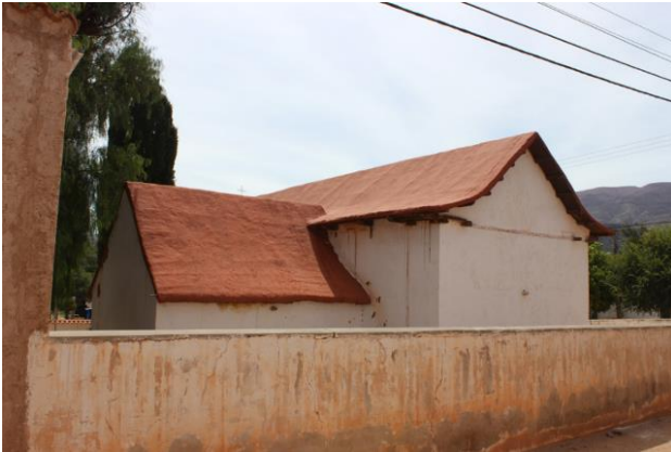
Figure 4. View of the current characteristics of the roof in the Chapel of Uquía © Authors.