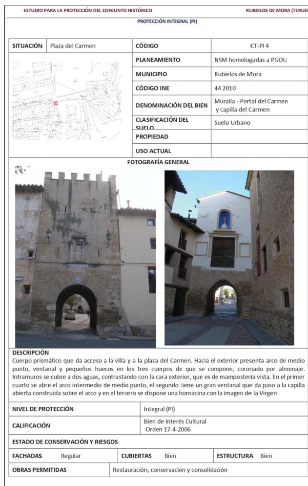
Figure 4. Inventory card. Remains of the medieval town walls of Rubiellos de Mora (Sanz Zaragoza, 2017).

This section needs to reflect the most remarkable buildings and spaces in the HE and their most significant features. Then, a level or category of protection must be assigned to each of them. The content must include general data of the building or site, its protection category (I, II, III), an extensive description, a location map, details about its use, state of conservation, the interventions allowed for this category of protection, photos, etc.