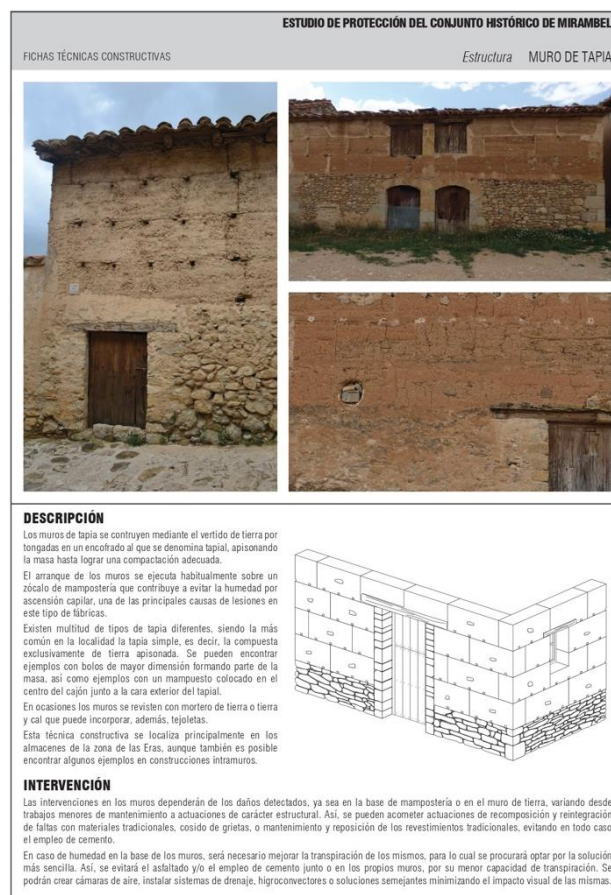
Figure 3. Extract of the typology inventory. Construction techniques: rammed earth walls in Mirambel (Vegas et al., 2018).

Besides, it is advisable to plan some specific draft regulations to apply to each of the identified morphological units (blocks, neighbourhoods, streets, squares, etc.).