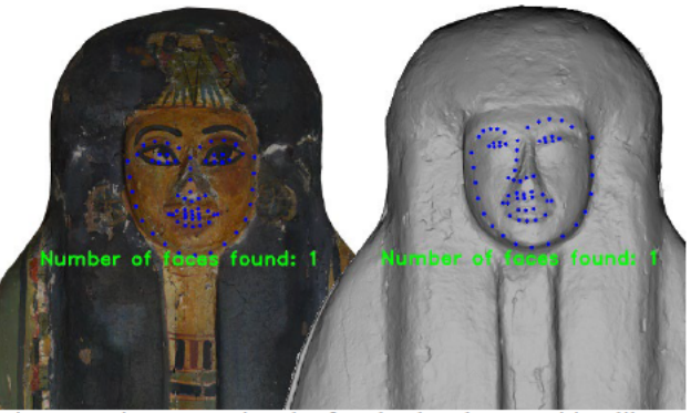
Figure 8. First tests using the face landmark recognition library on coloured and not coloured orthophotos of the same coffin.

Despite these limits, the decision to test an automatic solution for extraction of facial features was taken (Figure 8).