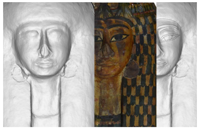
Figure 2. From left to right: greyscale orthophoto, coloured ortophoto, and digitisation of facial features from coloured ortophoto applied onto the greyscale one.

In this way it is possible to show any possible corrections of the paint applied to sculpted/modelled faces and/or whether they match or not. The comparison between physical geometry and visual appearance of the faces helped the principal investigator of the project to discern and reveal significant discrepancies. First observations showed that faces can be rounded or square, sometimes not symmetrical, or well proportioned; in some cases, the eyes are at different levels, the mouth is out of position regarding the central axis, which can create a distortion of the two halves of the face, or individual features are not placed in the correct relationship to each other.