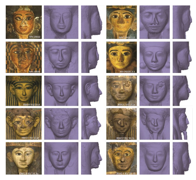
Figure 3. Comparison between textured and not textured orthophoto.

In one case, the jaw seems to display prognathism; with all the specimens, the eyebrows follow the extension of the line of the nose that continues from the curve of the eyebrows: this curve, however, can be straight and slightly tilted at the ends, rounded or arched; the nose can be thin and proportionate, large at the base or very big; the mouth can be narrow and fleshy, or thin and straight (Figure 3).