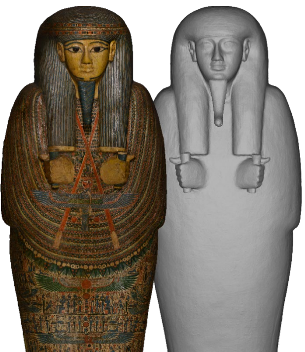
Figure 1. From left to right: orthophoto with and without colour. Inner lid of Djedmontiuefankh, early 22<sup>nd</sup> Dynasty (©Rijksmuseum van Oudheden, Leiden).

The photogrammetric elaboration considered the use of Agisoft Metashape 1.7.5 and followed these steps: i) photo-alignment at high resolution; ii) automatic recognition and manual check of circular and cross non-coded targets; iii) scaling; iv) dense cloud reconstruction and data cleaning; v) mesh model; vi) texturing; vii) developing and exporting high-resolution orthophoto, textured and not textured (Figure 1).