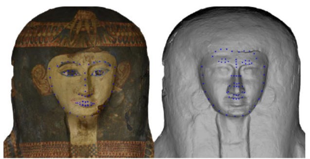
Figure 9. An example of wrong detection of landmarks. On the left, the points are correctly positioned. On the right, the detector failed in finding the position of mouth, nose, eyes, and eyebrows.

The detector was tested on 10 pairs of orthoimages, coloured and not coloured, and the results are not satisfatory although, in a way, promising. The facial landmarks were recognised on 7 pairs of images, but only in 5 cases was the face correctly recognised (Figure 9).