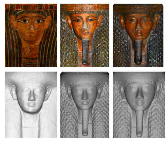
Figure 4. Coffin set of Butehamon with and without texture. From right to left: outer lid (CGT 10101.a), inner lid (CGT 10102.a) and the mummy board (CGT 10103).

Museo Egizio di Torino hosts the full coffin set of the scribe Butehamon: outer coffin (CGT 10101.a-b), inner coffin (CGT 10102.a-b) and the mummy board (CGT 10103). The coffins arrived in 1824 with the Drovetti collection and had been probably found in a re-used tomb in Deir el-Medina (TT 291). The coffin represents a male figure with braided (inner coffin and mummy board) or striped (outer coffin) tripartite wig with uncovered, sculpted, and naturalistic ears. All the surface is richly decorated, and the image repertoire combines typical New Kingdom elements with 3<sup>rd</sup> Intermediate Period theological creations. On the base of the decoration, the coffins fall in 3 different typologies all dated to the beginning of the second half of the 21<sup>st</sup> Dynasty (990-970 BC ca.) (Niwinski, 1988 and 2004). The set is particularly interesting because we can find similar elements and others very different from each other (Figure 4).