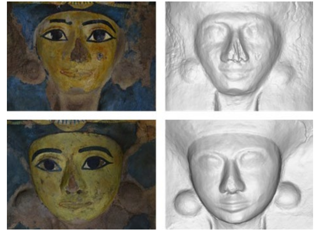
Figure 6. Comparison of digital twins and 3D models of the mummy board of Ikhy (above) and its outer coffin (below).

The mummy board has a more square-shaped face with high cheekbones and a square chin; the nose is long, very large in the lower part, with flared nostrils; the mouth is closed, forming a hint of a smile with well-defined, large, fleshy lips. Conversely, the face of the outer coffin presents fine features with rounded cheekbones, chubby cheeks, and a slightly pointed chin; the nose is small and well-proportioned with 'regular' nostrils, and the mouth, closed too, is linear and fleshy but less than those of the mummy board. Moreover, along with these so different facial features, we note that the mummy board presents a modification of some sculpted elements by means of the paint, possibly made to unify the style of decoration both in the mummy board and the outer coffin. This is evident in the mouth: the paint does not reflect the underlying features, but changes them, from a hint of a smile and a mouth with well-defined, large, fleshy lips to a smaller, closed, unsmiling mouth.