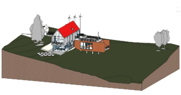
Figure 1. The BIM model

(Industry Foundation Classes) definitions which are represented by 3D GameObjects. The application development is released by the use of AR Foundation Augmented Reality API (Application Programing Interface).