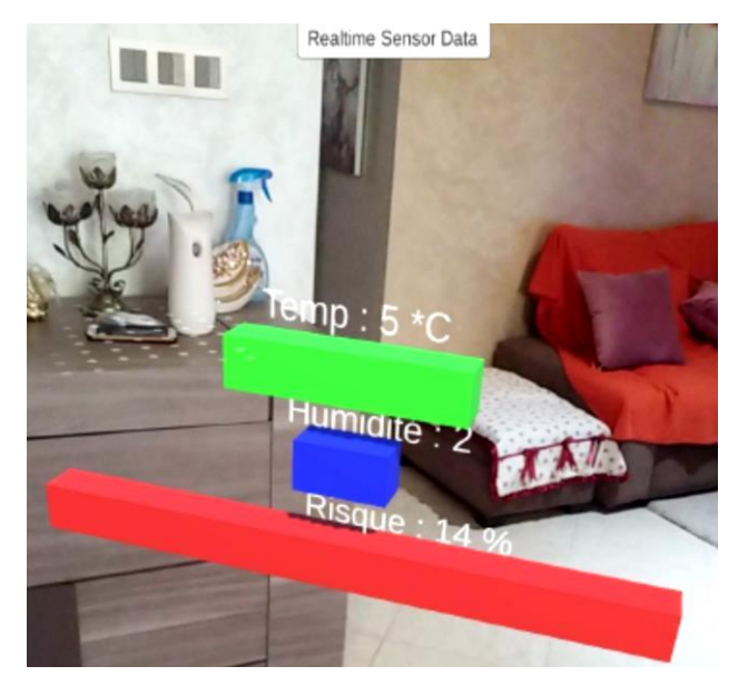
Figure 6. Visualization of real-time information from sensors.