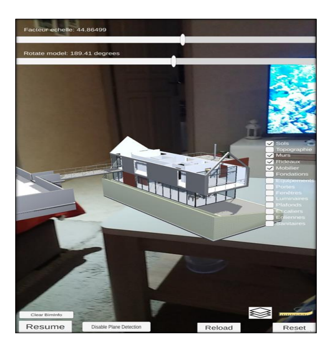
Figure 3. Visualization of BIM information related to each "BIM Object"

Scene2 (Measures and collaboration): Taking measurements on detected planes is a useful tool. This functionality places tiny spheres on user screen touch and saves their 3D coordinates, the line renderer is then utilized to draw a line between the two entities, which gives a realistic measurement sensation. A 3D "TextMeshPro" is used to display dynamically the distance on the 3D line ( Figure 4 ).