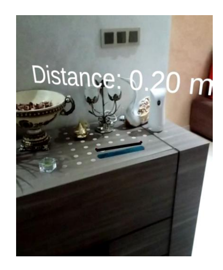
Figure 4. Distance measurement

Scene3 (BIM-IoT): This scene allows visualization of information from sensors. Sensor data are stored in a datasheet database and then integrated into the AR application. We can access information about temperature, humidity and a calculated risk score from the two first information. After plane detection,