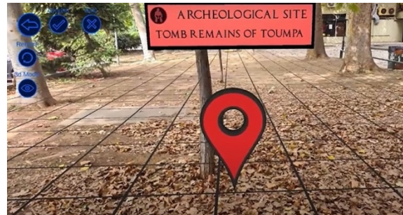
Figure 1: Demo presentation of SmartEye App.

Many countries host in their underground a plethora of ancient remains, many of which are known to us through excavations carried out at the respective sites. These remains are of great archaeological interest, as they contribute to the world heritage and become an object of great interest. In this context, a large number of visitors come annually to the places where archaeological excavations have taken place, thus demonstrating the special influence of these sites in the tourism industry. However, many of these remains after their registration are reburied in order to avoid exposure to the external environment and as a result, they are no longer visible, which can degrade the tourist tour experience. The problem of invisibility of ancient remains seems to create a fertile ground for the use of Augmented Reality technology (Figure 1), as it promises realistic and oriented three-dimensional representations of virtual objects in the real surrounding archaeological site.