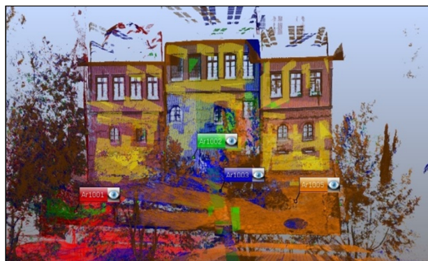
Figure 10. Scanned Skoutaris Mansion in 3D and surrounding landscape.

The acquired data that carried highly detailed spatial information were imported into SCENE and Pointools Edit software programs for further processing which included point cloud visualization. A unified point cloud was obtained through the control points, the coordinates of which guided the registration of the four adjacent point clouds. The transformation of raw point clouds into a unified coordinate system uses scanned targets in a local coordinate system to solve the transformation parameters. After registering the scans using corresponding points, the software constructs a non-redundant surface representation, where each part of the measured object is only described once. The scanned building in 3D along with its surrounding landscape is presented in Figure 10.