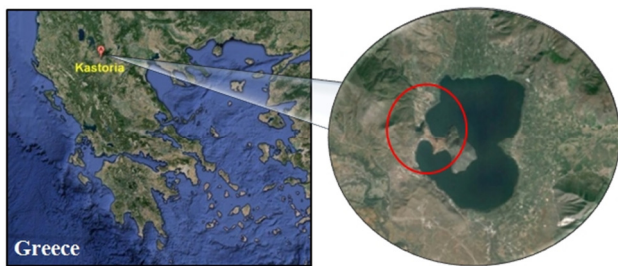
Figure 1. The location of the Regional Unit of Kastoria in Greece (left image) and the city of Kastoria in the red circle (right image) (Karagianni, 2019).

districts) (Moutsopoulos, 1989). The lake which surrounds the city is included in the Natura 2000 network, offering unique habitats for many endangered fauna and avifauna species (Ponce de León, 2015).