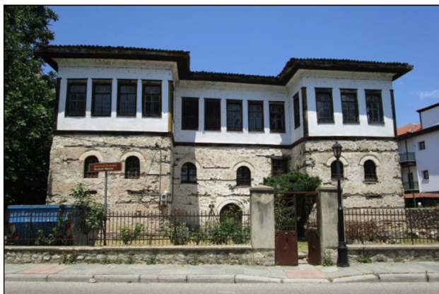
Figure 2. Skoutaris Mansion (image taken by the author).

Skoutaris Mansion is located on the south side of the city, along the coast of the lake in the Doltso traditional district and it is a representative building of the area (Figure 2). The ground plan has a 'II' shape, with windows on the first floor, while the windows on the second floor stand out for their larger size. The main entrance of the building is located on the south side, between the two basements. There is also a courtyard with vegetation both on the main side of the building and on the back.