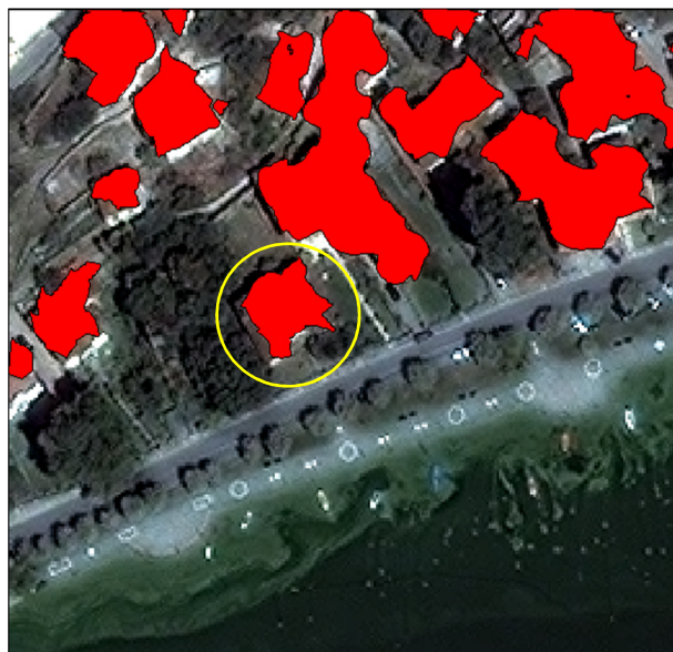
Figure 6. Roofs in red color acquired from QuickBird subset image through object-oriented feature extraction (roof of Skoutaris Mansion in the yellow circle).

The final layer representing the rooftops of the buildings could be very useful for interpretation purposes. Ambiguities related to the roof variations in size, color and shading due to different materials used or different orientations towards the sunlight were addressed using several representative roof samples.