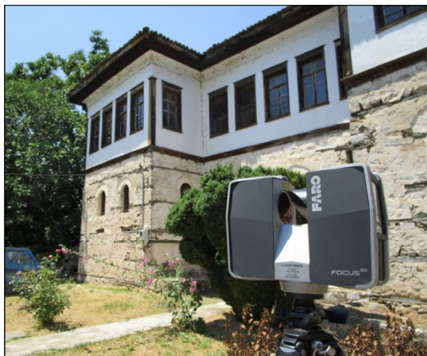
Figure 7. FARO Laser Scanner (image taken by the author).

The scanner was set up horizontally using a tripod. The scanning process included the inclination of laser pulses changed by a reflecting mirror, reflection of laser pulses on the surface of the building and reception of reflecting laser signals leading to an effect. Through this process, dense 3D coordinate information was acquired efficiently and accurately across the entire surface. Colored scan recording was also enabled, allowing the device to take color photos of the scanned environment with the integrated color camera. These photos were taken right after the laser scan and were used in the point cloud processing to automatically colorize the recorded scan data. The scan profile was set to outdoor conditions fitting the needs of the scene and the desired scan quality.