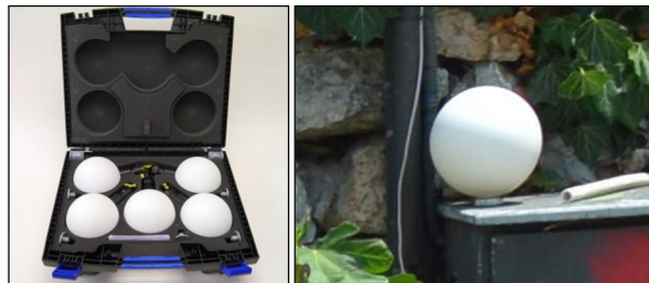
Figure 9. Reference spheres (images taken by the author).

In order to ensure that the system would generate reference points and register signal contacts, artificial targets were placed in the scene. The targets that were used to extract distinct points were five spheres of bright material. The spheres were placed in positions that covered the scene horizontally and vertically, at different heights and were completely visible in all scans (Figure 9).