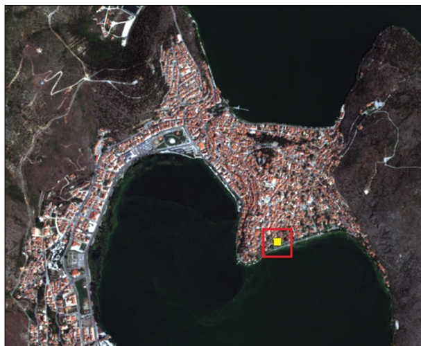
Figure 3. Position of Skoutaris Mansion (yellow dot) in the subset of QuickBird image covering the main part of the city of Kastoria.

To get detailed information about the city of Kastoria and the area where the Skoutaris Mansion house is located, high resolution multispectral QuickBird satellite imagery was used that was acquired from DigitalGlobe on 2010-07-29 (Figures 3 and 4). It is a cloud-free, standard ortho-ready Level-2A product (radiometrically and geometrically corrected), with projection information: UTM, zone 34, spheroid & datum WGS 84. QuickBird satellite was launched on October 18 of 2001. The sensor has 4 multispectral bands with a resolution of 2.44 m at nadir: Band 1 - Blue (0.450-0.520 \mu\text{m} ), Band 2 - Green (0.520-0.600 \mu\text{m} ), Band 3 - Red (0.630-0.690 \mu\text{m} ), Band 4 - Near Infrared (0.760-0.900 \mu\text{m} ) (QuickBird Information Sheet, 2021).