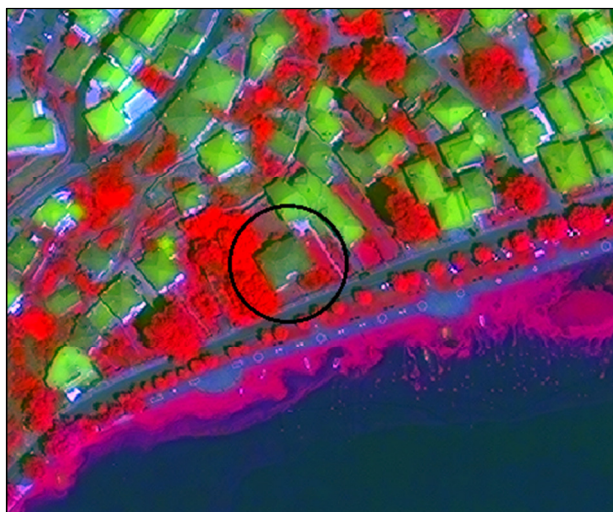
Figure 5. Skoutaris Mansion in the black circle (QuickBird subset image after decorrelation stretch).

Further digital processing of the image was performed to extract useful information for additional interpretation and monitoring of the surrounding area. The original image was enhanced through decorrelation stretch algorithm, which applies a contrast stretch to the principal components of the image in order to decorrelate the bands and produce a strongly colored output image with high contrast using the Principal Components Transformation (ERDAS Field Guide, 2011). After the implementation of spectral enhancement, areas covered by vegetation are highlighted, buildings are delineated as shadows are minimized and color differentiations in the lake are more evident (Figure 5).