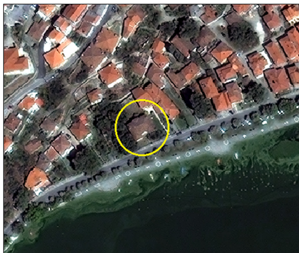
Figure 4. Skoutaris Mansion in the yellow circle (QuickBird subset image in true color composite).

The building is located on the south side of the city (traditional district of Doltso) near Orestiada Lake. The main entrance of the building is at the southeast and faces the main coastal road. The presence of vegetation around the mansion is evident. In addition, differentiation in the color of the roof of the building is noticeable, in comparison to the surrounding buildings.