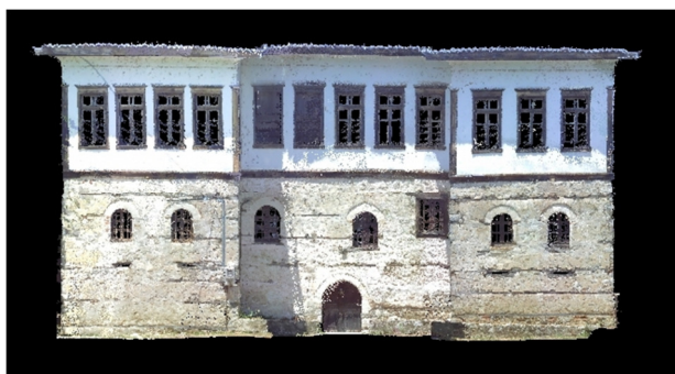
Figure 11. Skoutaris Mansion main facade.

The main facade of Skoutaris Mansion after the scanning process is presented in Figure 11. The generated model can be used for measuring distances and angles by clicking onto distinct points. Employing facade's ortho-projection, measurements of basic elements can be done directly onto the image. The measurement capabilities of the building, in combination with the detection and monitoring capabilities offered by enhanced satellite images of the area could provide useful information for the restoration and preservation of the mansion in the future.