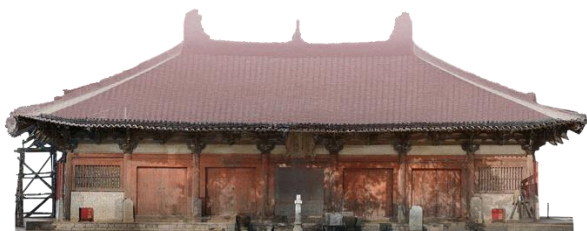
Figure 7. Exhibition image- front elevation of the East Main Hall- point cloud model image processed

In the first phase, exhibition research mainly involves in-depth study and research of digital survey and documentation results and other conservation related research of the East Main Hall. The exhibition is aimed for audiences of non-professional background, so balance between telling stories from an expert's perspective and telling stories from the audiences' perspective need to be considered. Thus, content selection and means of display need to be taken into consideration at the same time of research result translation.