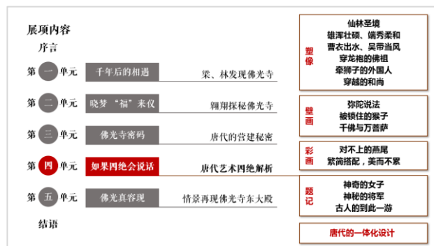
Figure 9. List of content headings of "the fun module"

The first draft of the exhibition proposal was completed in 2019; modifications and revisions on the translation of research results into exhibition contents are still in progress.