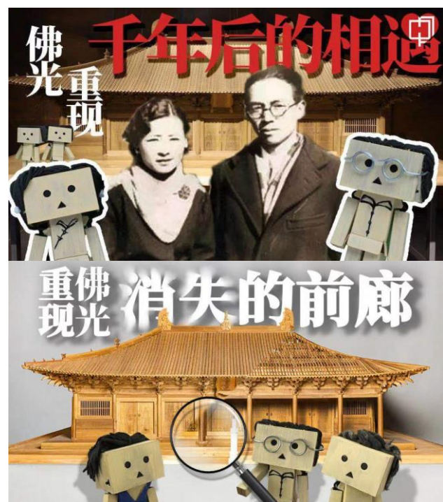
Figure 11. Covers of the first two episodes of animation series: Foguang Rediscoveries

Although the episodes share the same artistic style of casts, character voice, and physical models as stage set, their outlines and narratives are organized in different ways to serve various themes. The first episode focuses on representing how the investigation group rediscovered the Foguang Temple, therefore a linear narrative is used to make audiences feel as if they were on the spot with the protagonists. In the second episode, on the contrary, the story is set using Point of View (POV) and imitates a popular variety show called Crime Scene . Scholar characters from different times were gathered; they acted as detectives and collected evidences respectively to find out the whole picture of historical restoration of the East Main Hall. As episode 2 shows academic history across the century and engaging people from different times, POV allows main characters to state their findings from their own standpoints.