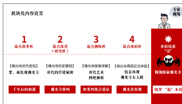
Figure 8. Five modules of exhibition content