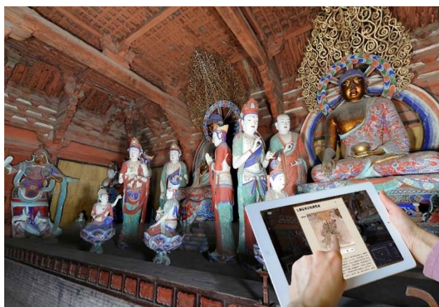
Figure 5. Portable digital navigation system in use on-site

The three-part on-site presentation strategy is still in the drafting phase; the project team has developed a trial version of the portable digital navigation system named "Meet with the masters in Foguang Temple" which was installed in portable tablets and tested on-site by visitors for free.