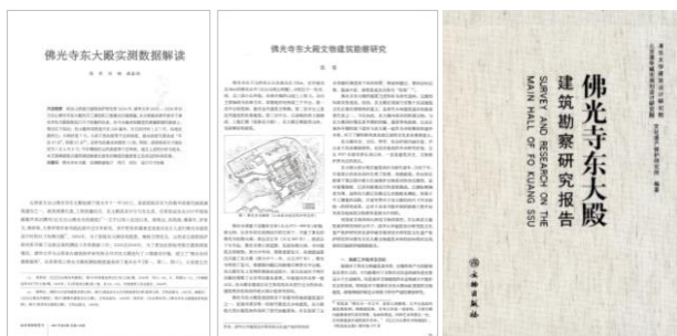
Figure 1. Phase 1 survey research results published

In 2015, Beijing Guowenyan Cultural Heritage Conservation Center Co., Ltd. and the Cultural Heritage Conservation Team of Tsinghua University carried out the second phase of the comprehensive digital survey, in which the survey and research objects are extended to the colored statues, murals, inscriptions and colored paintings in and around the East Main Hall; these cultural relics can better reflect the traces of history of the East Main Hall from its completion to the present. Through careful analysis and logical deduction, they could reveal the development and changes of the East Main Hall in various historical periods. This project was composed of four parts: digitization, survey, monitoring, and information collection and management.