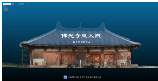
Figure 3. Digital Information Management Platform of the East Main Hall of Foguang Temple, developed by Beijing Guowenyan Cultural Heritage Conservation Center

only survey results, but also testing and experimental analysis results, empowering the platform to systematically manage all the digital data based research and analysis of the East Main Hall.