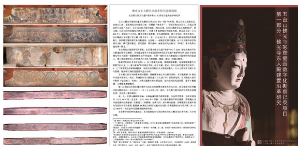
Figure 2. Phase 2 survey and research work

In 2015, Beijing Guowenyan Cultural Heritage Conservation Center Co., Ltd. and the Cultural Heritage Conservation Team of Tsinghua University carried out the second phase of the comprehensive digital survey, in which the survey and research objects are extended to the colored statues, murals, inscriptions and colored paintings in and around the East Main Hall; these cultural relics can better reflect the traces of history of the East Main Hall from its completion to the present. Through careful analysis and logical deduction, they could reveal the development and changes of the East Main Hall in various historical periods. This project was composed of four parts: digitization, survey, monitoring, and information collection and management.