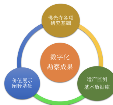
Figure 4. Project goal of future digital survey project

The process of digital survey research itself is the process of analyzing, understanding, and interpreting the heritage value. In view of cultural heritage presentation and interpretation, digital survey results can be used as important source of material. With the help of online interactive display functions, developing a digital information platform that not only manages all the data, showcases conservation research results, but also delivers the value of the East Main Hall to the public in an explorational and dialogical way is the aim of the digital survey project in the next phase.