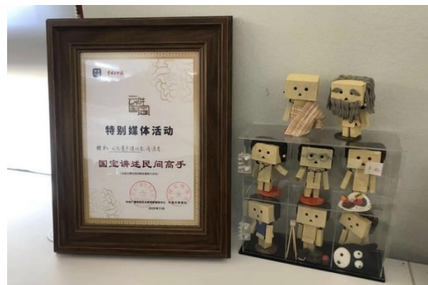
Figure 10. The cartoon characters used in the animation series

material heritage and the people related to it can contribute to the heritage values.