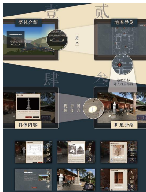
Figure 6. "Meet with the masters in Foguang Temple" Portable digital navigation system (trial version), developed by Beijing Guowenyan Cultural Heritage Conservation Center

different historical scenic spots from the initial navigation map interface, select the information tags attached to the panoramic videos, which synchronizes with the real scene, and choose the information highlight points of their interest to see extended information that they cannot get onsite. The extended information attached to the system includes not only professional knowledge derived and translated from academic research, such as Dougong Design, types of Colored Painting, etc., but also includes short stories such as the rediscovery of Foguang Temple (with Mr. Liang Sicheng and Ms. Lin Huiyin as the narrators), and interactive games such as "search for inscriptions", making the system more appealing to the visitors.