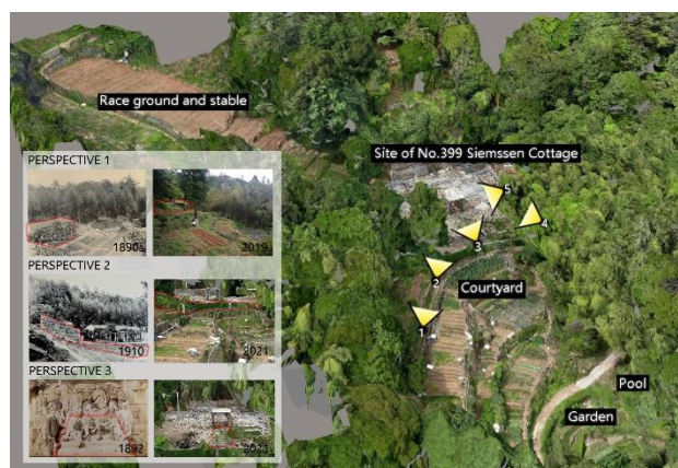
Figure 3 A 3D-Model of the Siemssen & Krohn Co. cottage in Kuliang, generated by a DJI Mavic Air drone. It provides more chances to compare the historical photos with current situation, especially for those blocks which are under construction.