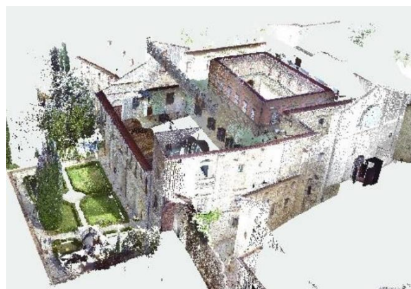
Figure 4. TLS point cloud

The Mobile Mapping System used to survey the test area was the ZEB Revo Real Time (RT). This instrument is an MMS based on a SLAM algorithm and is equipped whit a handheld laser scanner and a RGB camera. ZEB Revo Real time RT represent a rapid mapping solution: the survey of the entire architectural complex required only about 125 minutes. This system has been adopted to survey the most difficult areas of the building to reach through the use of TLS and characterized by little lighting so as not to allow perfect photogrammetric acquisition, such as the underground rooms of the buildings.