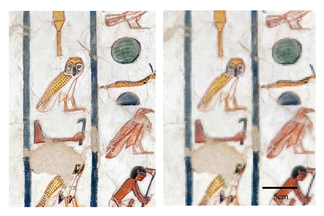
Figure 2. A detail of the orthophoto in Figure 1 captured with 0.35mm/pixel GSD (left) and the same image at 5.0mm/pixel GSD (right), demonstrating the effect of GSD on the level of visible detail.

Spatial resolution for photogrammetry can be defined as the Ground Sample Distance (GSD), given as a real-world measurement of the distance between two pixel centers in an image, which is determined by a combination of the sensor size, pixel size, focal length, and the distance of the camera from the surface (Figure 2) (Stylianidis et al., 2016).