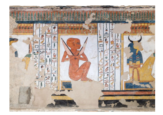
Figure 1. A detail of an orthophoto from the 2017 survey of the wall paintings in Chamber K of the Tomb of Nefertari (Credit: Carleton Immersive Media Studio; Carleton University. © J. Paul Getty Trust).

A condition assessment of the wall paintings undertaken in 2020 found that the resolution of the captured images and orthophotos was not high enough to clearly distinguish small losses and cracks. This prompted a deeper exploration of the relationship between the spatial resolution of capture and the level of visible detail in the captured and processed images.