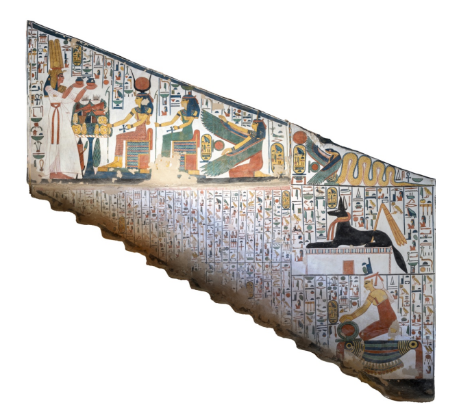
Figure 4. The lower half of the stairway wall paintings in this orthophoto are in shadow due to the position of a handrail in the Tomb of Nefertari.