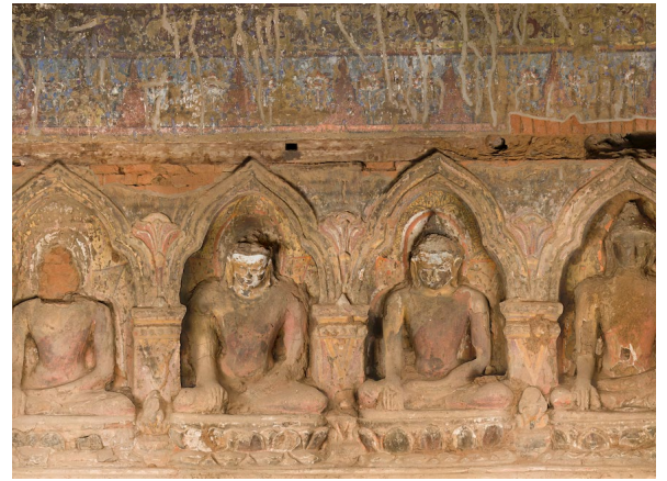
Figure 7. The 2020 orthophoto of the East inner wall in Myinpya-gu, showing the same section as Figure 5. The image is mostly in focus and evenly lit but still has shadows cast in the niches (Credit: Carleton Immersive Media Studio; Carleton University. © J. Paul Getty Trust).