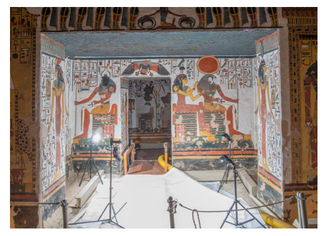
Figure 3. Speedlights and a white sheet were used to reflect light onto the paintings for even lighting during the 2017 survey of the Tomb of Nefertari (Credit: Carleton Immersive Media Studio; Carleton University. © J. Paul Getty Trust).