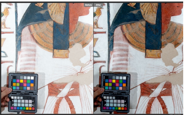
Figure 5. An example of post-processing white balance and exposure correction using an X-Rite ColorChecker® Passport in the Tomb of Nefertari survey before (left) and after (right) (Credit: Carleton Immersive Media Studio; Carleton University. © J. Paul Getty Trust).

Color is an important attribute of a wall painting and images need to be color corrected to serve as a useful record for future condition monitoring. Due to a wall painting's large scale, lighting conditions can change during the survey and color charts and gray cards designed for conservation imaging should be regularly included in the capture. In the Tomb of Nefertari, color charts and gray cards were used successfully to color correct the images (Figure 5).