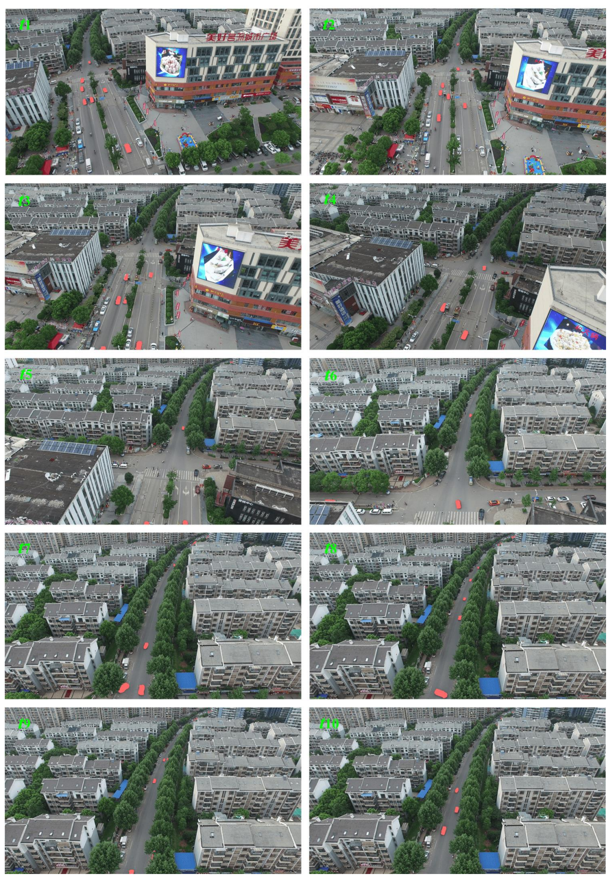
Figure 2. Example time-series vehicle detection from oblique UAV images. Red footprints indicate all vehicle instances

The International Archives of the Photogrammetry, Remote Sensing and Spatial Information Sciences, Volume XLVI-M-2-2022 ASPRS 2022 Annual Conference, 6–8 February & 21–25 March 2022, Denver, Colorado, USA & virtual