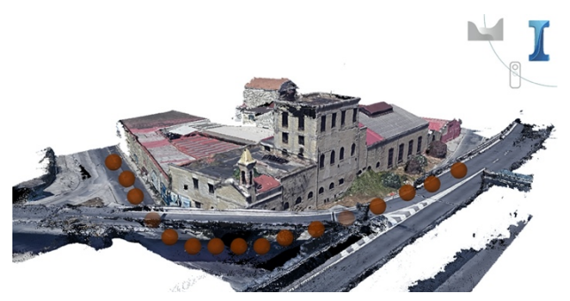
Figure 6 . Detail of the 3D model obtained with SFM algorithms applied to spherical images acquired by rapid mapping techniques (in red the acquisition points).

As these contexts, due to both their physical nature and the social environment that inhabits them, do not lend themselves to data collection operations for digitisation using sophisticated instrumentation, solutions were studied and applied to capture and process digital data quickly and inexpensively. Specifically, by exploiting Structure from Motion algorithms, various urban elements (such as viaduct pylons, elevated roads, etc.) were modelled from image-based point clouds, processed from spherical photographs acquired with a 360° terrestrial camera, the InstaOneX2. By installing the spherical camera on a special stand, photographs were taken with a distance between one station and the next of approximately 3 meters and a height above ground of approximately 1.80 meters. The acquired shots were then processed from image-based point clouds by means of the well-known SfM Agisoft Metashape app, which allows the direct processing of equirectangular images from which a point cloud is first reconstructed and then the textured polygonal model is triangulated with an algorithm derived from Delaunay (Figure 6). The latter was imported, in the .obj format, into Infraworks and used as the primary resource for modelling employing the Infraworks database's own element categories so as to obtain parametric objects with information attributes referring to geometry and visual appearance consistent with the LOD3 level. (VC)