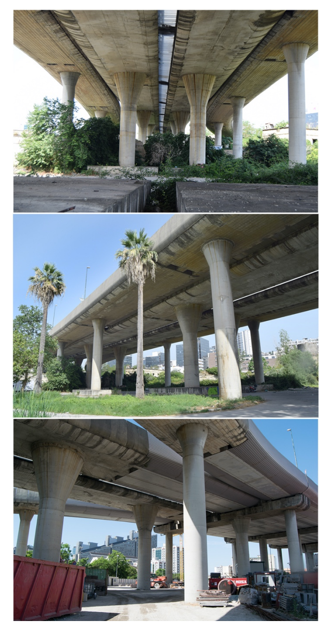
Figure 1. B-ROAD spaces in the East Side of Naples.

The B-ROAD research project aims to achieve two main purposes. Firstly, it deals with producing knowledge about B-ROAD urban areas through collecting data and describing their potential architectural features, given that they have never been regarded as urban spaces thus far. B-ROAD spaces (Figure 1) are often perceived as hostile, unclean, and treacherous places. This common belief, though often justifiable, is, in fact, the effect of a misunderstanding, namely an ambiguity between ethics and aesthetics. What is perceived as immoral, illegal, or socially dangerous is considered unappealing, despicable, undesirable or unworthy as architecture or public space (Stendardo, 2016).