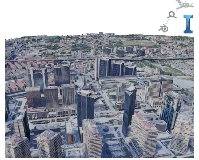
Figure 5. Model acquired via the frame debugger and Blender software.

Finally, for all those elements that are particularly relevant to B-ROAD, such as road junctions and the residual spaces that