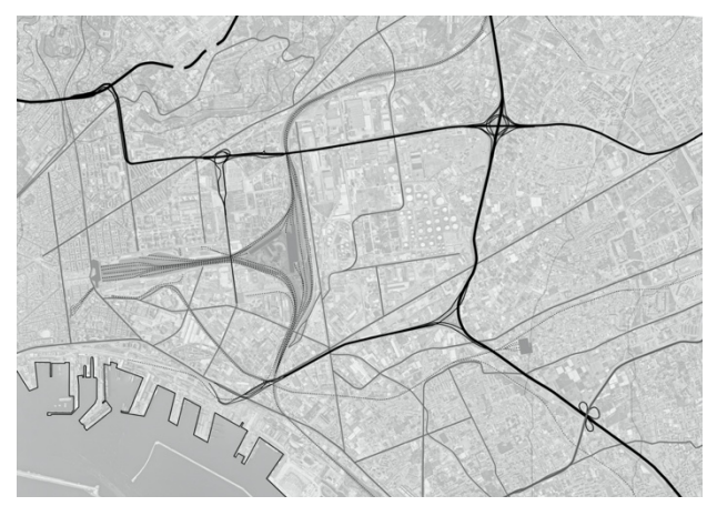
Figure 2. The East Side of Naples. The main infrastructural lines are highlighted

railway station, the airport, many container yards as well as to a wide industrial district rich with oil and petrol tanks that are gradually being decommissioned. As a result, the district is expected to undergo radical urban regeneration, including a large urban park, buildings for retail and business, housing, and several facilities.