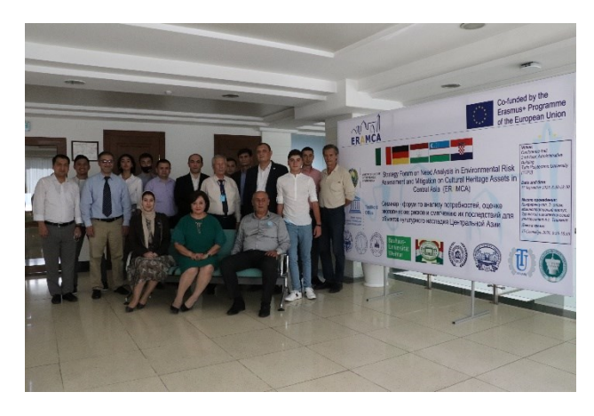
Figure 1. Participants in the Strategic Forum of the ERAMCA project (Tashkent, September 2020)

During a workshop, the invited experts presented the current situation in respective Countries regarding risk assessment and mitigation. They pointed out the need for a new generation of technicians (engineers and architects) to work in a multidisciplinary context by merging different expertise.