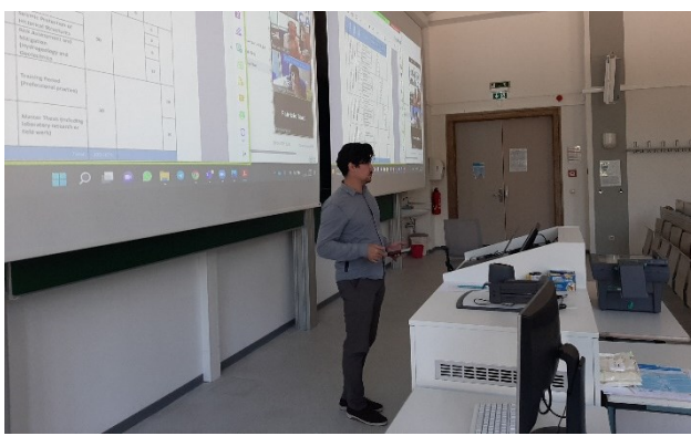
Figure 5. Practical (above) and theoretical (below) sessions of the training week.

As usual for ERASMUS+ initiatives, having a joint meeting between European and no European teachers is a great possibility to have a fruitful cultural exchange of experiences and a possibility to understand how European approaches can be articulated and adapted in the context of different cultures and traditions.