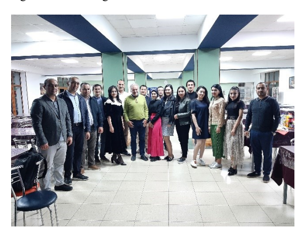
Figure 6. Teachers and students of the Eramca Master in Turin Polytechnic University of Tashkent

Once the licenses had been obtained, the four involved Central Asia Universities started recruiting potential students and a strong selection among the candidates.