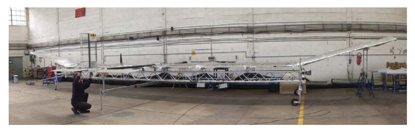
Figure 1. Mercator being prepared at Bertrix airfield