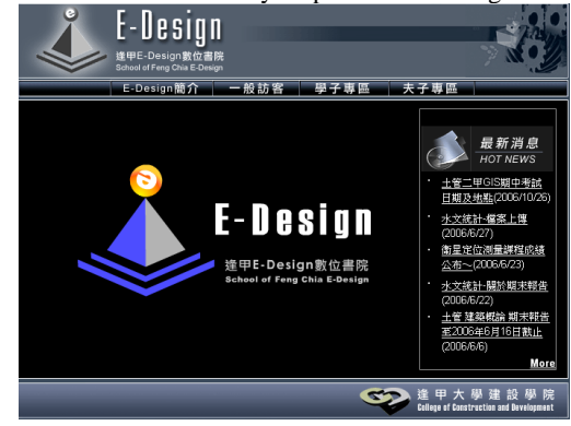
Figure 2 GIS Education Platform-" e-Design" Learning Arc GIS Online

Instructors will prepare teaching materials for a variety of courses including handout, presentation slides, and references and then display them on web as teaching in classes. After a class, students can browse information on web for reviewing or downloading. See the Figure 2 (1) indicates various courses; (2) shows course content for reviewing; (3) provides the quick access to GIS hub when analyze spatial data during classes.