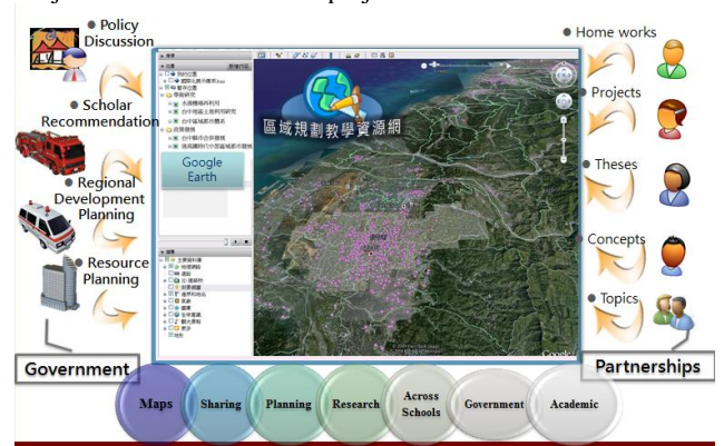
Figure 6 Regional Planning and Education Resources Website 3.3.3 Integrate GIS data warehouse

3.3.2 E-learning Platform to provide solutions and resources This platform provides solutions and resources. Different levels of image scales have been integrated into the system. For instance, aerial photos, satellite images, UAV images are included. Each of the subjects may link to different sources of image data. This will be facilitated for the user to use various subjects to handle their own projects.