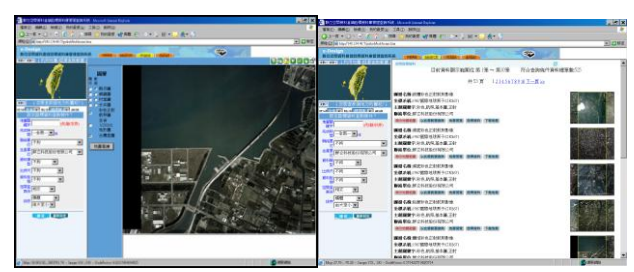
Figure 4 GIS Hub for preview the search result of spatial data