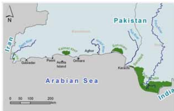
Figure 7: Mangroves Forest sites in Pakistan

Satellite image processing of coastal areas is subjective to tide height, as it is a function of the time of the day, season and geographical locations. High tide values may impede visual interpretation and spectral analysis of mangroves covered in satellite imagery. Quantification of creek areas, mud flats, algal mats, mangroves cover, and saltbushes could vary its extent due to the variations in tide status. Seasonal variation of vegetation phenology is another factor that varies the extent and health of algae, as the reflectance of algae in tidal flats is subject to its phenology which is directly related to water temperature or moisture content and therefore may also obscure the quantification process of mangrove cover. Considering seasonal and tidal aspects, and image availability, multi-spectral satellite images of ALOS - AVNIR-2, were acquired (Table 1)